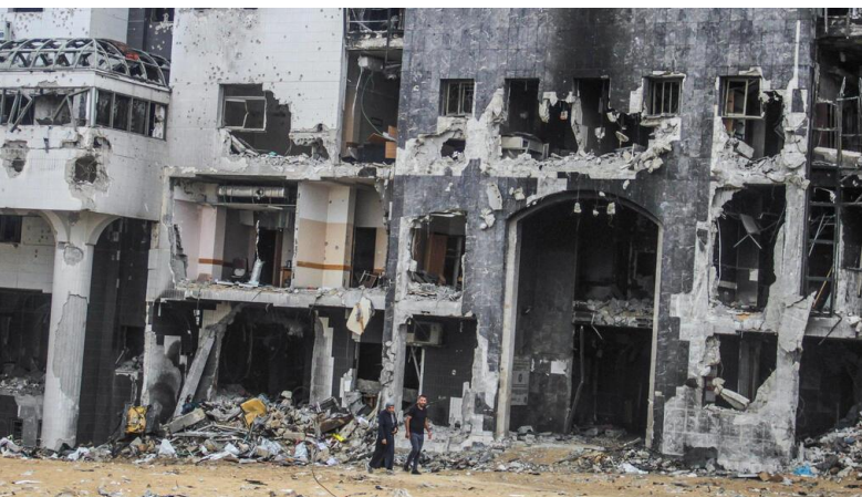
Shifa Hospital in Gaza after an IDF raid

"Children in particular have borne the brunt of these attacks, suffering both directly and indirectly from the collapse of the health system," said Pillay, whose