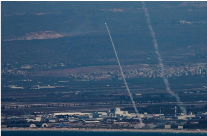
Israel's Iron Dome anti-missile system intercepts rockets launched from Lebanon towards Israel, amid cross-border hostilities between Hezbollah and Israel, as seen from Acre, northern Israel, September 26, 2024.

Earlier, approximately 40 rockets were identified crossing from Lebanon toward the upper Galilee on Thursday morning, the IDF reported.