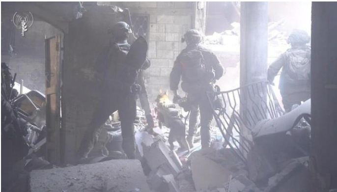
IDF forces

So far, after nine days of ground operations, the IDF has not disclosed whether any Hezbollah terrorists have been captured. However, reports suggest that close encounters with Hezbollah have resulted in their deaths , contrasting with the capture and interrogation of thousands of Hamas terrorists in Gaza over the past year, which provided valuable intelligence, including on the issue of Israeli hostages.