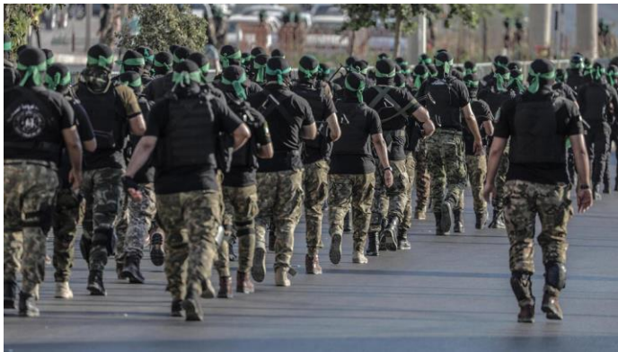
Hamas terrorists in Gaza

losses. The term is reserved for the most serious international crimes knowingly committed as part of a widespread or systematic attack against civilians.