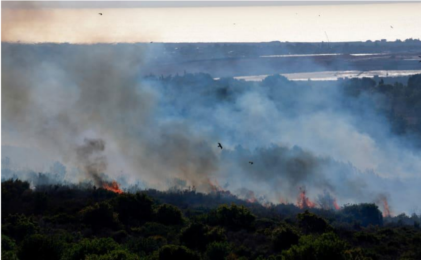
A view shows smoke and flames, amid ongoing hostilities between Hezbollah and Israeli forces, near Nahariya, Israel, October 3, 2024.

Four individuals were being treated by Magen David Adom (MDA) medics and paramedics, following the recent barrage to Israel's North, Maariv reported Thursday afternoon, citing MDA.