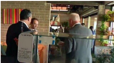
Doug Emhoff, Tim Walz leaving a coffee shop's cashier's stand without paying