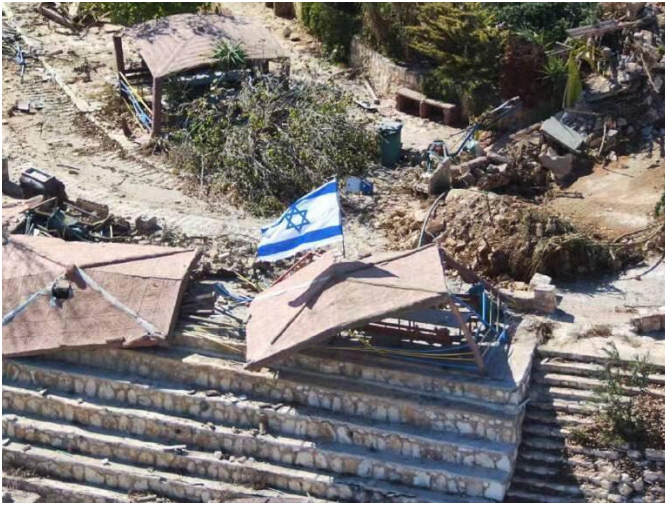
Israeli flag in Maroun al-Ras

This relates to the recent ground operation in the village of Maroun al-Ras, where the Golani Brigade was active. The IDF has warned for years that Hezbollah possesses the capability to locate mobile phones, potentially exposing the exact positions of forces. This capability could facilitate mortar and rocket attacks or allow terrorists to be dispatched for direct assaults.