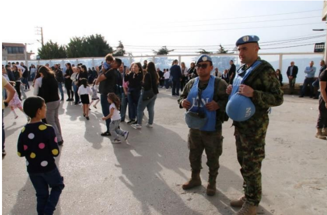
Members of the United Nations peacekeepers (UNIFIL) stand together at the church square on Good Friday in the town of Klayaa, southern Lebanon, March 29, 2024.

Israeli forces fired on two positions used by UN peacekeepers in Lebanon on Thursday and at a third one on Wednesday, the UN force said, injuring two of its peacekeepers.