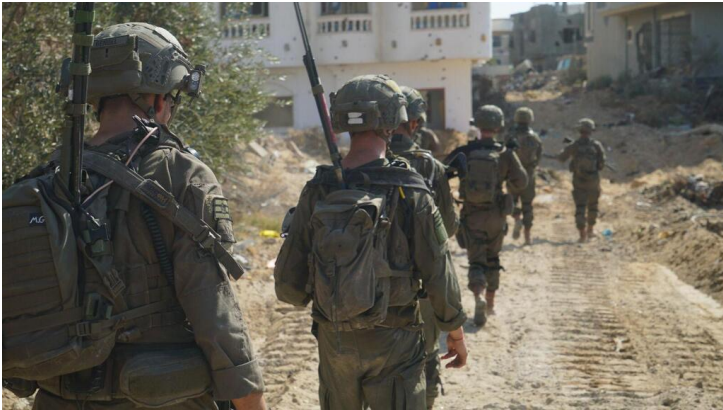
IDF forces in Gaza

The World Health Organization says over 10,000 patients requiring urgent medical evacuation have been prevented from leaving Gaza since the Rafah border crossing with Egypt was shut in May. The Palestinian health ministry says nearly 1,000 medics have been killed in Gaza in the past year in what the WHO called "an irreplaceable loss and a massive blow to the health system". How many of the medics were packing a gun for Hamas or transporting