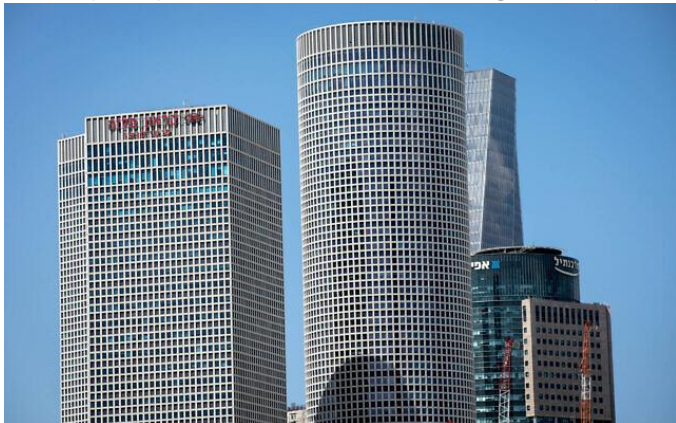
The Azrieli towers in Tel Aviv, June 19, 2023.