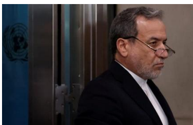
Iran Foreign Minister Abbas Araghchi walks, on the sidelines of the 79th United Nations General Assembly at UN headquarters in New York, US, September 24, 2024.

By SETH J. FRANTZMAN NOVEMBER 20, 2024 15:36 Updated: NOVEMBER 20, 2024 18:59