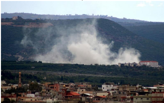
A photo taken from the southern Lebanese city of Tyre shows smoke rising from the site of an Israeli airstrike on the village of Qlaileh on November 19, 2024.

Hochstein’s trip to the region came as fighting showed little sign of easing, with at least 70 rockets fired into northern Israel on Tuesday, an Israeli reservist killed in a Hezbollah drone attack in southern Lebanon and a key Hezbollah commander killed in an Israeli airstrike.