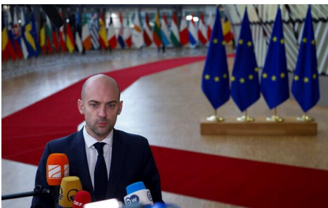
French Foreign Minister Jean-Noel Barrot speaks to media before a meeting of EU foreign ministers at the European Council building in Brussels on November 18, 2024.

Araghchi, speaking with his French counterpart, Jean-Noel Barrot, "strongly condemned the decision of the three countries of Germany, France, and the United Kingdom" in moving to propose the draft, warning it "will only complicate the matter further," according to a statement by the ministry on Wednesday.