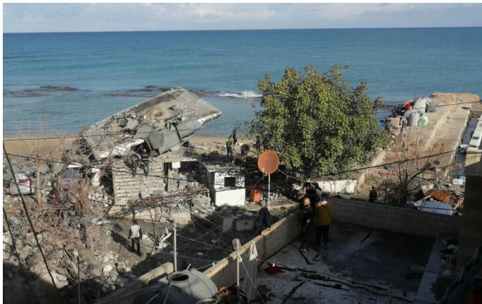
A Lebanese army inspection team check destruction at the site of an Israeli airstrike that hit a military position in the southern Lebanese coastal town of Sarafand on November 20, 2024.

The IDF said on Tuesday that it had expanded its deployment in southern Lebanon , sending troops toward areas where attacks have been launched against Kiryat Shmona.