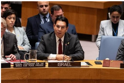
Israeli Ambassador to the UN Danny Danon

Danon also criticized the 14 council members who supported the resolution, accusing them of enabling terrorism. "You have reached a new low. You failed to uphold justice and peace, abandoning your basic responsibility to those who need you most. This resolution supported Hamas' terror," he said.