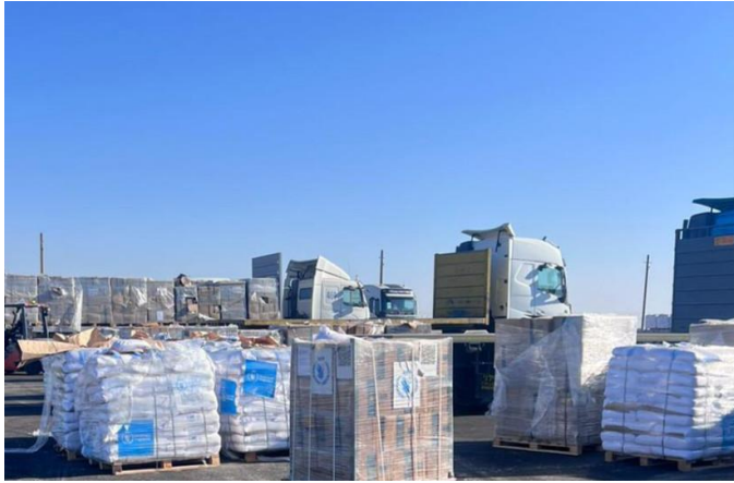
Transfer of humanitarian aid trucks into the Gaza strip through the "Kisufim" passage

The United Nations humanitarian coordinator for Gaza described cigarette smuggling as a "real cancer."