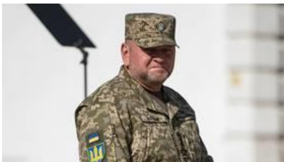
FILE PHOTO: Valery Zaluzhny in 2023.

Ukrainian troops currently being trained in the UK to fight Russia must steel themselves to face death and kill without a second thought, Kiev’s ambassador in London, Valery Zaluzhny has told the soldiers. The four-star general previously served as commander-in-chief of Ukraine’s armed forces.