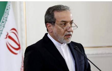
Iranian Foreign Minister Abbas Araghchi speaks during a joint press conference in Tehran, on November 19, 2024.

Western countries on Wednesday formally submitted a new resolution critical of Iran at the International Atomic Energy Agency ahead of its board meeting, diplomatic sources said, pushing ahead despite Iran's warnings against the move.