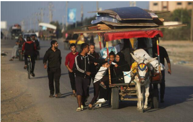
Palestinians flee the Israeli ground operation in Khan Younis, Gaza Strip, December 6, 2023.