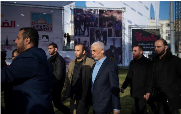
Yahya Sinwar, head of the Hamas terror group in Gaza, attends a rally marking Al-Quds Day, at a soccer field in Gaza City, April 14, 2023.

Sinwar is believed to have been in hiding in Hamas's vast tunnel network since the terror group launched its deadly attacks on southern Israel on October 7.