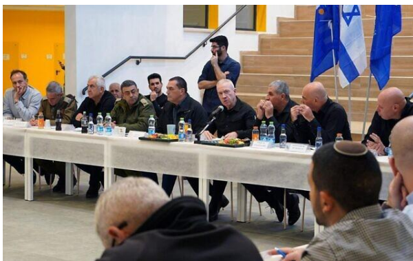
Defense Minister Yoav Gallant meets with mayors and local council heads of northern border towns in Nahariya on December 6, 2023.

Meeting local leaders of northern border towns on Wednesday, Defense Minister Yoav Gallant said Israel plans to force the Hezbollah terror group to move away from the border, and does not expect residents to return to their homes before it does so.