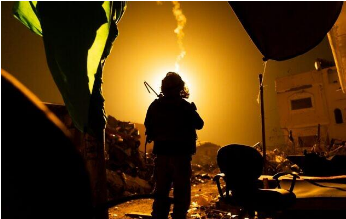
IDF troops operate inside Gaza, in this handout photo released on December 6, 2023.

The IDF said Wednesday evening that its troops had surrounded the city of Khan Younis in the southern Gaza Strip and were operating in its center, as Prime Minister Benjamin Netanyahu sent a message to Hamas's Gaza chief Yahya Sinwar that Israel was closing in on him, and rocket barrages from the Strip were fired at the southern city of Beersheba.