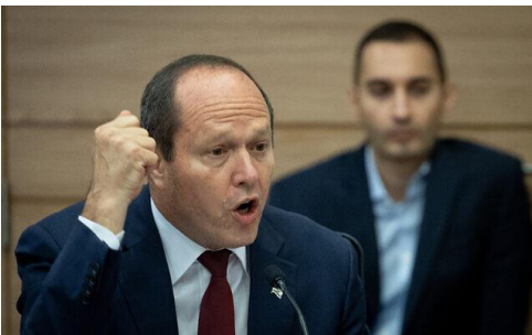
Economy Minister Nir Barkat at the Knesset in Jerusalem, on December 6, 2023

The proposed budget update only covers the last six weeks of 2023, and a separate budgetary reevaluation may occur for 2024.