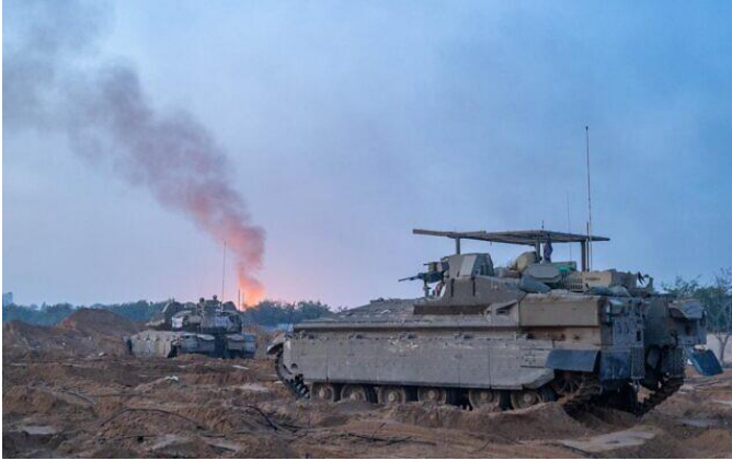
Israeli troops operating in the Gaza Strip in an undated photo released for publication on December 6, 2023

Acknowledging the wartime need to increase spending, Smotrich cautioned that Israel will have to cover its increased national debt in the future: “There are no free lunches and what we spend today we will pay for with interest in the coming years,” he told the plenum.