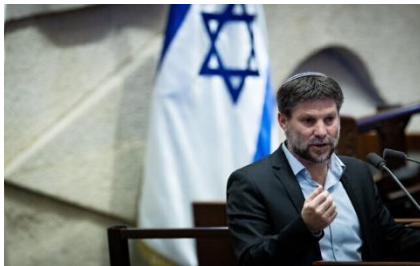
Finance Minister Bezael Smotrich presents his 2023 wartime budget update to the Knesset, December 6, 2023