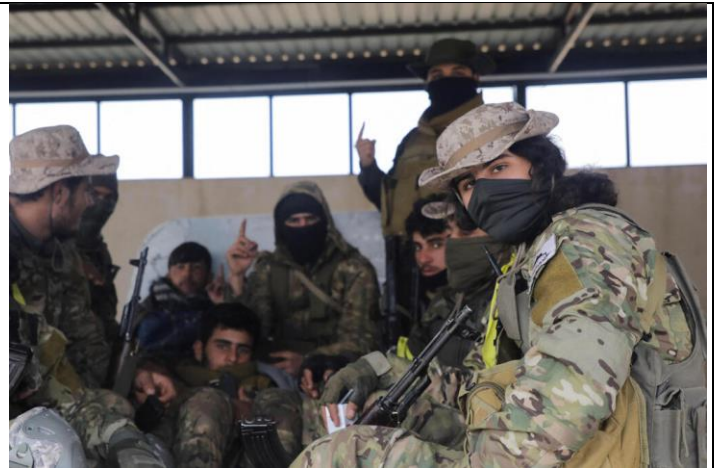
Rebel fighters on the outskirts of Homs, Syria