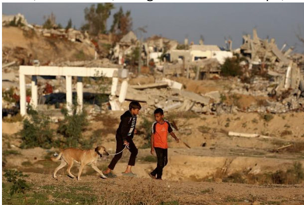
Children walk their dog amid the rubble of destroyed buildings in Nuseirat in the central Gaza Strip on December 2, 2025.

Acknowledging some of those disagreements, Netanyahu dismissed the idea of establishing a Palestinian state, which Merz, along with most of Europe, advocates.