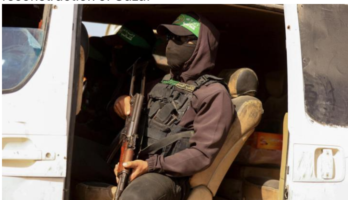
Hamas terrorist

The new phase aims to lay out a future for war-battered Gaza and promises to be even more difficult - addressing such issues as the deployment of an international security force, formation of a technocratic Palestinian committee in Gaza, the withdrawal of Israeli troops from the territory and the disarmament of Hamas. An international board, led by President Donald Trump, is to oversee the implementation of the deal and the reconstruction of Gaza.