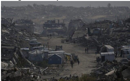
Palestinians walk through the destruction left by the Israeli air and ground offensive in Gaza City, December 5, 2025.

The UN suggested last month that it would cost approximately $70 billion to rebuild Gaza, where entire neighborhoods have been flattened, estimating that around 75 percent of buildings in the Strip have been damaged or destroyed.