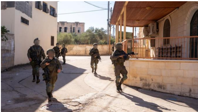
IDF troops operate in the northern West Bank.

By JERUSALEM POST STAFF DECEMBER 7, 2025 22:25