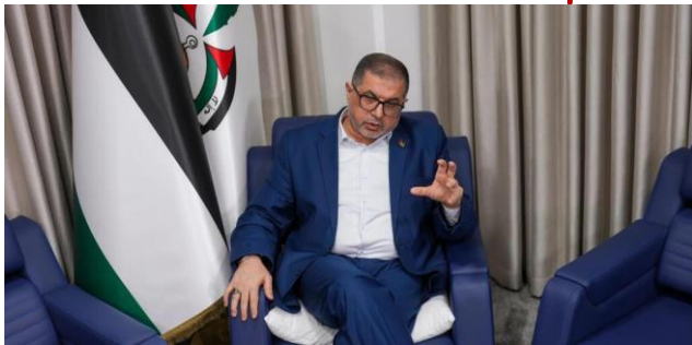
Bassem Naim

Bassem Naim, a member of Hamas' decision-making political bureau, spoke as the sides prepare to move into the second and more complicated phase of the agreement.