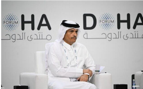
Qatar's Prime Minister Sheikh Mohammed Abdulrahman Al Thani attends a session on the opening day of the Doha Forum, an annual diplomatic conference, in Doha, December 6, 2025.