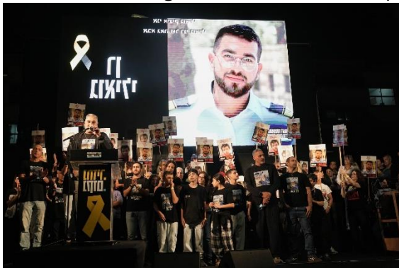
A photo of slain hostage Ran Gvili, whose remains are being held by Hamas in the Gaza Strip, is displayed during a rally calling for the return of the deceased hostages held in Gaza, in Tel Aviv, Israel, on Nov. 29, 2025.

Under the October 9 agreement signed by Israel and Hamas, the terror group was given 72 hours to complete the return of all remaining living and deceased hostages. The process has been drawn out amid difficulties locating the bodies on Hamas’s part and mutual accusations of violations of the ceasefire.