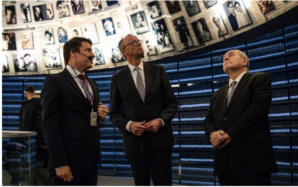
Yad Vashem chairman Dani Dayan (R) stands with German Chancellor Friedrich Merz at the museum's Hall of Names in Jerusalem on December 7, 2025.

Earlier on Sunday, Merz reaffirmed Berlin's support for Israel during a visit to the Yad Vashem national Holocaust memorial in Jerusalem, stating that "Germany must stand up for the existence and security of Israel," after acknowledging his country's "enduring historical responsibility" for the mass extermination of Jews during World War II.