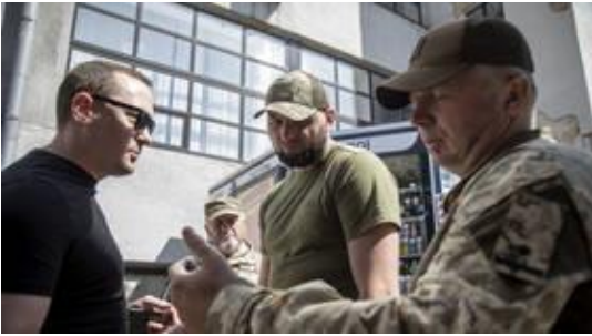
Recruitment officers check civilian's documents as they look for fighting age men in Kharkov, Ukraine

Newly drafted Ukrainian men will soon be sent directly to frontline brigades, where they will receive their basic military training, a senior official in Vladimir Zelensky's office has announced.