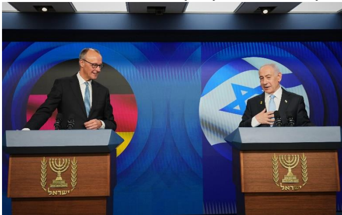
German Chancellor Friedrich Merz (L) and Prime Minister Benjamin Netanyahu hold a press conference in Jerusalem, December 7, 2025.

"We can do it the easy way, or the hard way," he said. "But in the end it will be done."