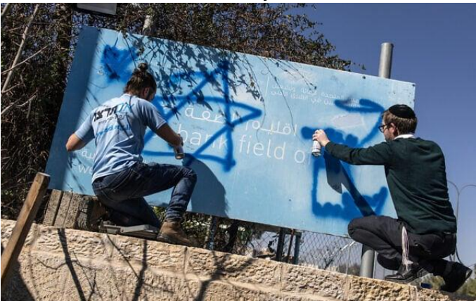
Israeli right-wing activists deface a sign in front of the shuttered gate of UNRWA's West Bank Field Office in Jerusalem on January 30, 2025

Under the 1946 Convention on the Privileges and Immunities of the UN , later ratified by Israel, the UN and its assets must not be taxed by host countries.