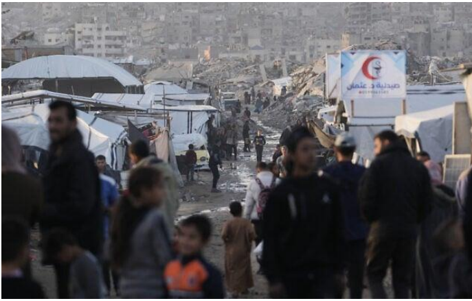
Displaced Palestinians walk through a muddy pathway between tents set up amid destroyed buildings in Jabaliya, in the northern Gaza Strip, December 7, 2025.

Also likely on the agenda for Netanyahu's visit is the issue of the negotiations for a new security arrangement with Syria, which have almost completely stalled as Israel has reportedly changed its demands in exchange for withdrawing its troops from territories in southern Syria that it has occupied since last December.