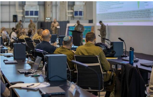
Israeli and US Army soldiers discuss civil-military operations inside the Civil-Military Coordination Center (CMCC) on October 28, 2025.

The US military declined to comment to The Guardian on the allegations.