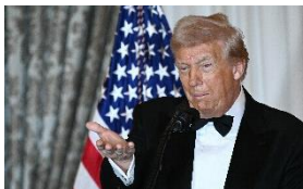
US President Donald Trump speaks during the Kennedy Center Honors dinner ahead of a day before the gala, at the State Department in Washington, DC, December 6, 2025.

Netanyahu said he would discuss phase two of the plan with Trump during his White House visit later this month.