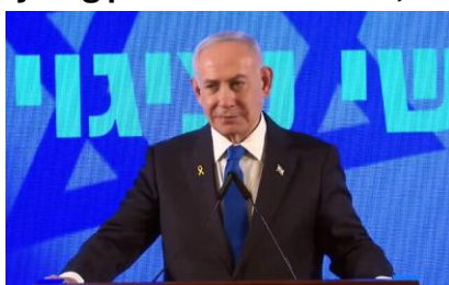
Netanyahu says he'll give multinational force a chance, and in the end, disarmament 'will be done'; also claims Israel is 'stronger than ever'

By Lazar Berman and Tol Staff Today, 5:55 am