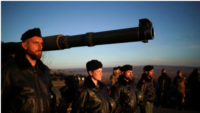
Italian army soldiers stand in formation during the visit of NATO Secretary General Mark Rutte to the multinational battle group at the Novo Selo training ground, Bulgaria, December 19, 2024.

By AMICHAEL STEIN DECEMBER 8, 2025 20:58 Updated: DECEMBER 8, 2025 21:12