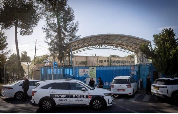
Police raid an UNRWA facility in East Jerusalem, December 8, 2025