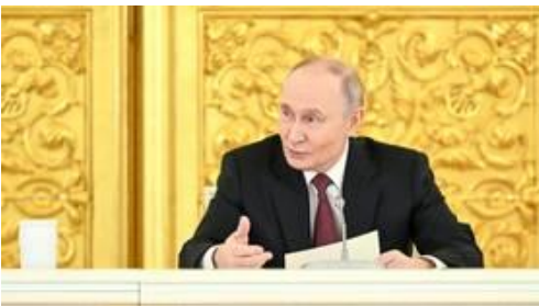
Russian President Vladimir Putin.

Russian President Vladimir Putin has proposed a new initiative to raise birth rates in Russia, calling for measures that encourage more active fatherhood in addition to existing maternity support.