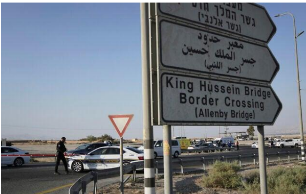
Israeli police stand guard near the site of a shooting attack where two soldiers were killed at the Allenby Bridge Crossing between the West Bank and Jordan, Sept. 18, 2025.

During a Monday meeting with Netanyahu, Waltz thanked Israel for reopening a crossing linking Jordan and the West Bank which was shut to aid earlier this year following a deadly attack by a Jordanian driving a truck carrying humanitarian assistance to Gaza.