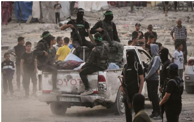
Hamas operatives search for the bodies of Israeli hostages in the Shejaiya neighborhood of Gaza City, November 5, 2025.

DOHA, Qatar — A Hamas source told The Times of Israel on Sunday that the group will only agree to give up its weapons through negotiations that result in the establishment of a Palestinian state.