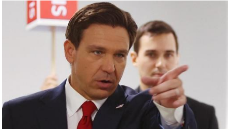
Florida Gov. Ron DeSantis

Neither CAIR nor the Muslim Brotherhood is designated as a foreign terrorist organization by the U.S. government.