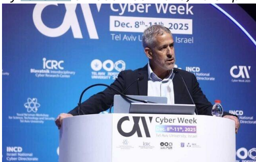
Former Shin Bet chief Ronen Bar speaks at Tel Aviv University's Cyber Week 2025 conference, on December 9, 2025.

Former Shin Bet chief Ronen Bar on Tuesday called for the government to establish a state commission of inquiry into the failures surrounding Hamas's October 7 attack, lobbying implicit criticism at Prime Minister Benjamin Netanyahu in his first public address since leaving his post in June.