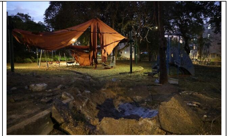
A crater next to a childs' play area in a park in a residential area of Tel Aviv caused by a missile fired from Yemen early on December 21, 2024.

It said details of the event were being looked into .Videos on social media showed the moment of impact and the failed interceptions.