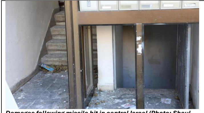
Damages following missile hit in central Israel