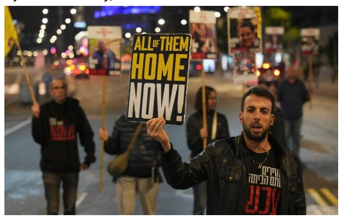
that were seemingly filmed in the last few weeks.

Protesters outside the IDF's Kirya military headquarters in Tel Aviv call for the release of the hostages on December 17, 2024.