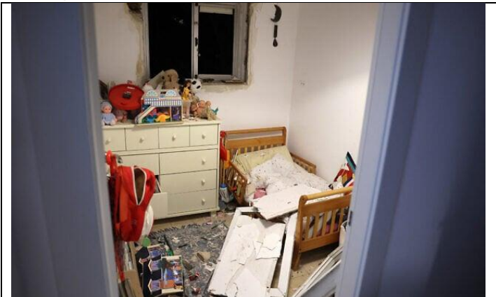
This picture shows debris in a bedroom in Tel Aviv early on December 21, 2024, after a projectile fired from Yemen struck near the building

The military confirmed that a missile originating in Yemen impacted in Tel Aviv, saying "attempted interceptions did not succeed."