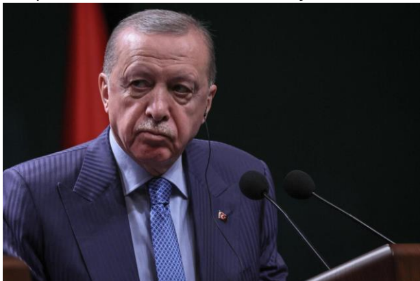
Turkish President Recep Tayyip Erdoğan

President Christodoulides said the talks reaffirmed the strategic nature of their alliance, based on shared values, interests and goals aimed at regional prosperity, stability and security. "The trilateral meeting deepened cooperation between us in a variety of fields," he said.