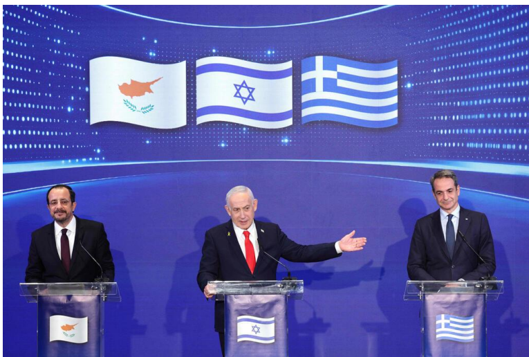
Cypriot President Nikos Christodoulides, Prime Minister Benjamin Netanyahu and Greek Prime Minister Kyriakos Mitsotakis