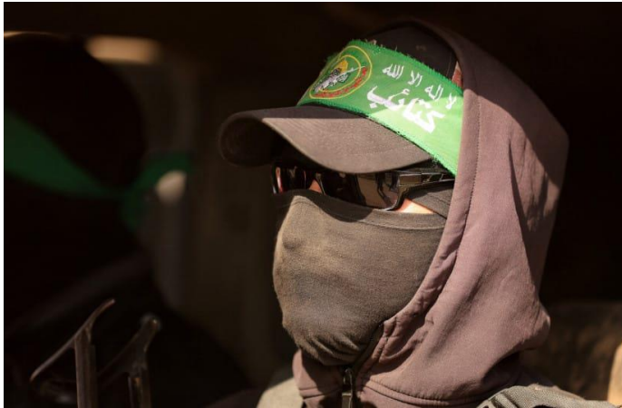
A Hamas terrorist sits inside a vehicle in Gaza City, November 20, 2025; illustrative.

"The message from those officials was: You do not want the war to resume. You also do not believe that a multinational force will disarm the terrorist organization. Therefore, this is the proposal that can work at the moment," a source familiar with the discussions said.