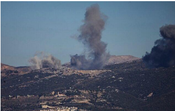
By Emanuel Fabian and AFP Today, 2:22 am Updated at 11:01 am

Beirut says one person killed and another wounded in attacks, as Israel continues to hit terror group over what it says are breaches of ceasefire