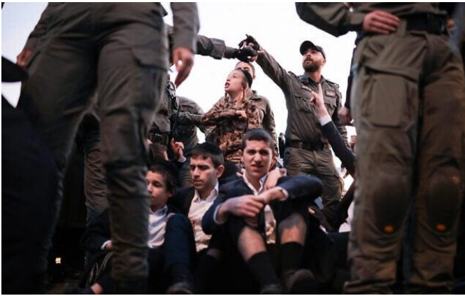
Security forces disperse ultra-Orthodox Jewish men blocking a road during a protest against conscription to the Israel Defense Forces, in Bnei Brak on December 22, 2025.

Hundreds of ultra-Orthodox protesters blocked traffic on a major highway for hours Monday, and one was arrested, in the latest in a series of raucous demonstrations against efforts to end Haredi men's de facto mass exemption from mandatory military service.