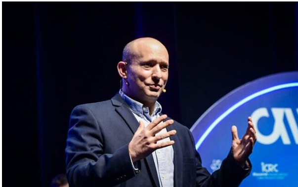
Former Israeli prime minister Naftali Bennett speaks at the annual Cyber Week at Tel Aviv University on December 9, 2025.