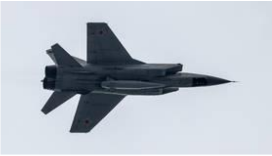
FILE PHOTO. A Russian MiG-31K fighter jet with Kinzhal hypersonic missile.

The Russian military has conducted concentrated strikes on Ukraine's military and energy infrastructure overnight, the Defense Ministry in Moscow has said.