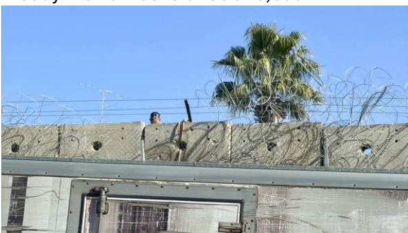
An illegal entrant peers through the fence moments before entering Jerusalem

According to the source, a significant portion of terror attacks in Israel have been carried out by illegal entrants. “We see an interesting pattern. The organizers themselves are afraid. They believe bringing someone in for work does not endanger them, but if that person carries out an attack, it becomes a different story. That is why they search them beforehand.”