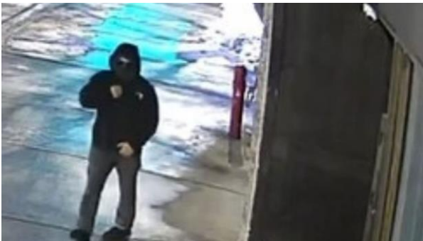
The suspect in the antisemitic MSU incidents.

By MICHAEL STARR DECEMBER 23, 2025 10:38 Updated: DECEMBER 23, 2025 10:43