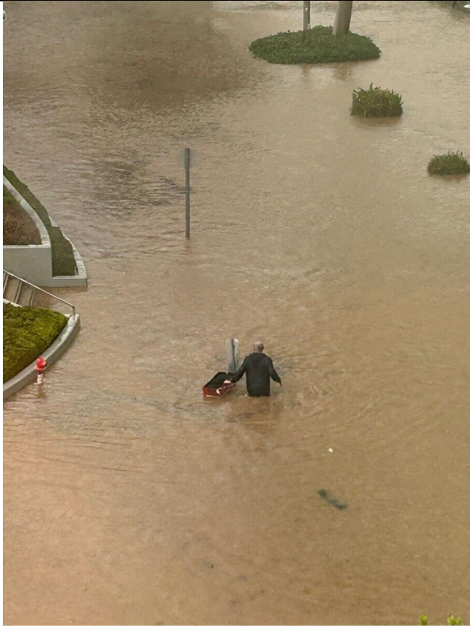
Netanya submerged after sudden downpour