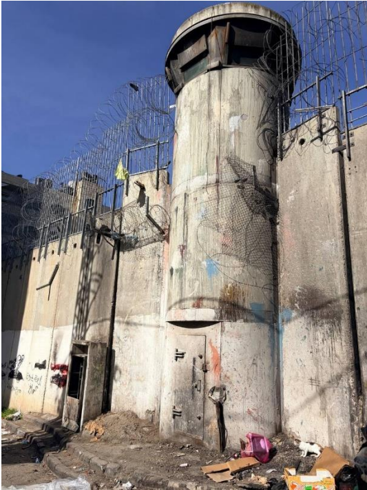
Unmanned for years: the abandoned guard tower (Pill Box) in north Jerusalem

This critical section of the security barrier has become a major weak point. The barrier consists of a high concrete wall topped with a metal fence added over the years. Illegal entrants damage the structure and, using ladders and ropes, manage to cross into the city. Equipped with cutting tools, they slice through the metal bars and rappel into Israel.