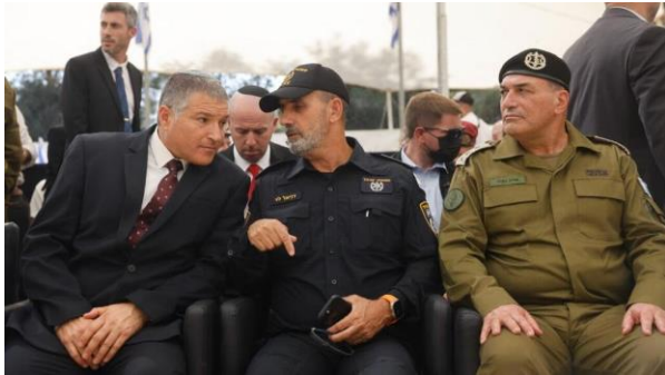
IDF Chief of Staff Lt. Gen. Eyal Zamir, Police Commissioner Daniel Levy and Shin Bet chief David Zini

In the report published today, Englman wrote that these failures heighten the need for ongoing discussion, review and oversight by the political and security leadership, particularly given the changing security reality and escalating threats since the war.