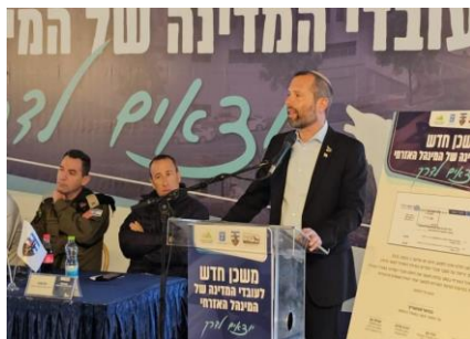
Finance Minister Betzalel Smotrich and Mateh Binyamin Regional Council Head Israel Ganz at ceremony marking official transfer of Civil Administration service units to permanent civilian complex, December 23, 2025.

Smotrich said the government is preparing for expanded civilian service delivery and instructed the Government Housing Administration to locate a southern facility, adding that “the day is not far off” when the new building would also serve future Israeli communities in Gaza .