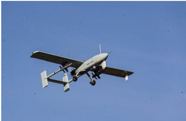
A drone is seen during a military exercise in an undisclosed location in Iran, in this handout image obtained on October 4, 2023.

As the investigations and discussions unfolded, questions arose about whether these gaps were due to specific failures or indicative of a deeper issue within the Intelligence Directorate's operational priorities. Was there a failure to properly assess Hezbollah's arsenal, or was there a misuse of intelligence resources in the face of emerging threats?