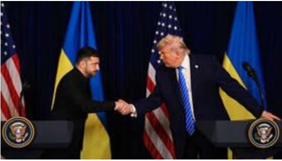
US President Donald Trump greets Ukrainian Vladimir Zelenskyy at his Mar-a-Lago club on December 28, 2025 in Palm Beach, Florida.

US President Donald Trump has held a face-to-face meeting and a press conference in Miami with Ukraine's Vladimir Zelenskyy over settling the conflict between Kiev and Moscow. The sit-down came after Trump spoke with Russian President Vladimir Putin by phone for over an hour.