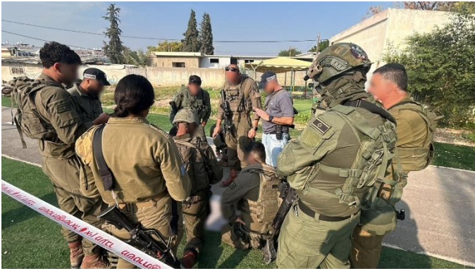
Senior officers of the IDF's 417th Regional Brigade conduct a situational assessment at the scene of a deadly terror attack in Beit She'an, on December 26, 2025.

The IDF said it was also mapping out the assailant's home in preparation for demolishing it. Israel says the move is aimed at deterring future attacks, but critics say evidence of the policy's effectiveness is weak and that it amounts to collective punishment.