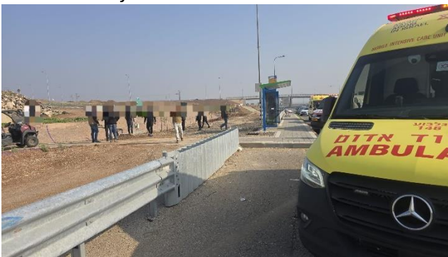
Paramedics arrive at the scene of a stabbing near Ein Harod in northern Israel on December 26, 2025.