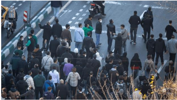
Protesters march in Iran. December 29, 2025.

By DANIELLE GREYMAN-KENNARD DECEMBER 29, 2025 17:03