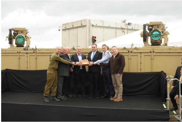
Senior Israeli defense and industry officials attend the handover ceremony for the Iron Beam laser air defense system at a Rafael Advanced Defense Systems facility, December 28, 2025.