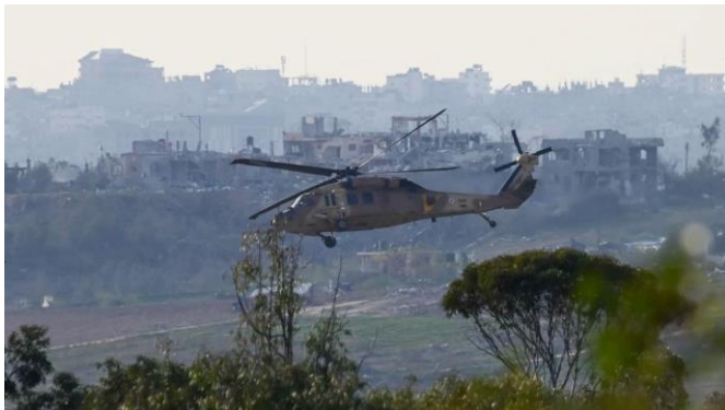
A military helicopter flies above the Gaza Strip, as seen from the Israeli side of the border, January 8, 2024

By YONAH JEREMY BOB DECEMBER 25, 2025 17:00 Updated: DECEMBER 25, 2025 19:56