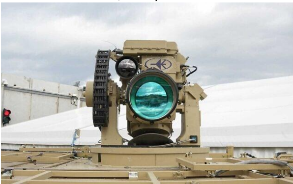
The IDF's first operational Iron Beam high-power laser air defense system, displayed during a handover ceremony at a Rafael Advanced Defense Systems facility, December 28, 2025.

The Defense Ministry announced on Sunday the delivery of the first operational high-power laser interception system developed by Rafael Advanced Defense Systems Ltd., dubbed "Iron Beam," to the Israel Defense Forces.