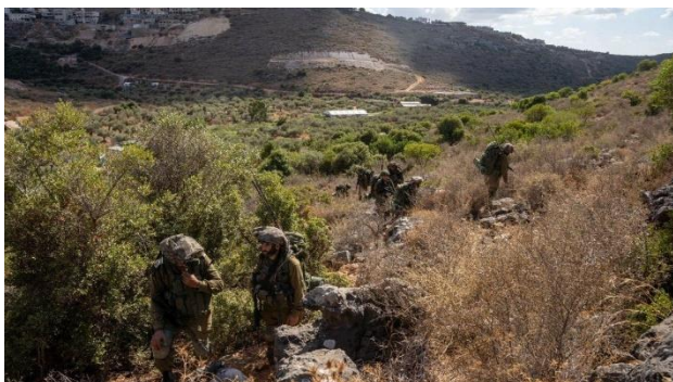
IDF soldiers seen operating in northern Israel, near the Lebanese border, September 18, 2024

In preparation for a future campaign against Hezbollah , the IDF highlighted two core operational gaps during its reviews and lessons-learning from its latest conflict with the terror organization.