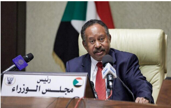
Sudan's Prime Minister Prime Minister Abdalla Hamdok chairs a cabinet meeting in the capital Khartoum, on September 21, 2021. (AFP)

KHARTOUM, Sudan (AFP) — Sudanese Prime Minister Abdalla Hamdok said on Tuesday that a foiled coup attempt, involving military officers and civilians linked to the ousted regime of longtime autocrat Omar al-Bashir, was the “latest manifestation of the national crisis,” referring to deep divisions during Sudan’s move to democracy.