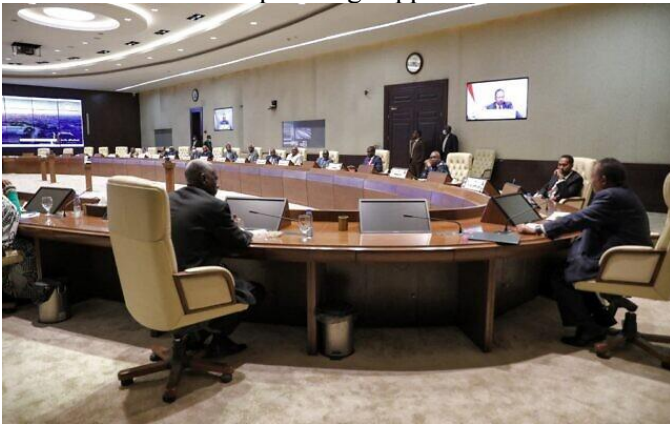
Sudan’s Prime Minister Prime Minister Abdalla Hamdok (right) chairs a cabinet meeting in the capital Khartoum, on September 21, 2021.

“Order has been restored and the leaders of the attempted coup, both military and civilian, have been arrested,” he said. “Authorities are pursuing supporters of the defunct regime” who took part.