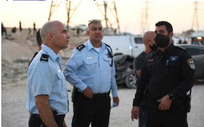
Police at the scene of a murder in the Negev, on September 21, 2021.

A man in his thirties was found shot dead on Tuesday in a car in southern Israel's Negev desert, the third apparent victim of Arab communal violence in two days and the 89th since the start of the year.