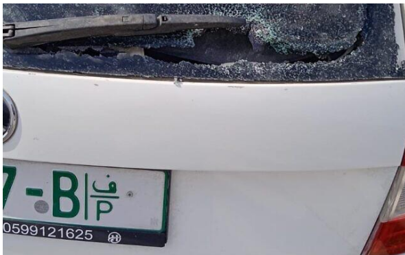
A Palestinian car allegedly smashed following clashes with Israeli settlers on Friday, on October 15, 2021

A few hours later, dozens of Israeli settlers and Palestinians hurled stones at one another near Yasuf, a Palestinian town in the central West Bank. At least two Palestinian cars were said to be smashed during the violence. The rights group also charged that settlers had sprayed pepper gas in the face of a 50-year-old Palestinian woman.