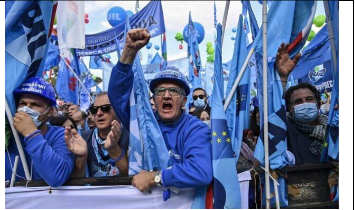
Workers from the Italian Labour Union (UIL) react during an anti-fascist rally called by Italian Labour unions CGIL, CISL and UIL at Piazza San Giovanni in Rome on October 16, 2021, a week after a demonstration against the so-called Green Pass degenerated into an assault on the CGIL trade union building, led by the neo-fascist Forza Nuova party.