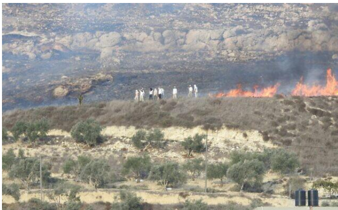
Israeli settlers clash with Palestinians near the West Bank town of Burin on Saturday, on October 16, 2021

Israeli settlers were filmed lighting fires and throwing stones at a Palestinian house near the West Bank town of Burin on Saturday as Israeli troops appeared to stand idly by, the latest in a spate of violent incidents during the ongoing olive harvest.