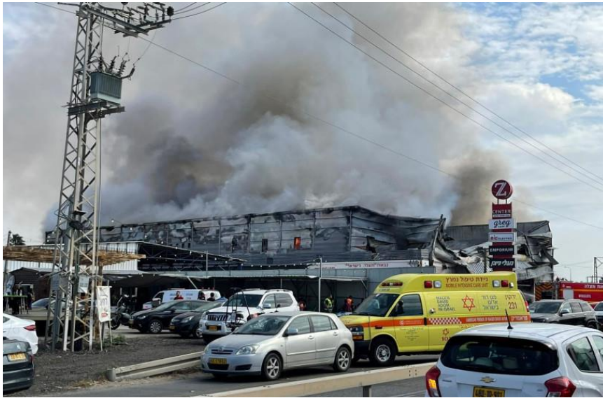
Fire at Kalansuwa shopping mall, October 16, 2021

By JERUSALEM POST STAFF OCTOBER 16, 2021 21:04