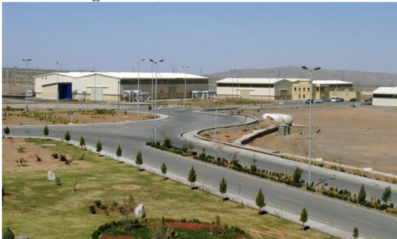
The Natanz facility

Arutz Sheva Staff, Oct 17, 2021 10:40 AM