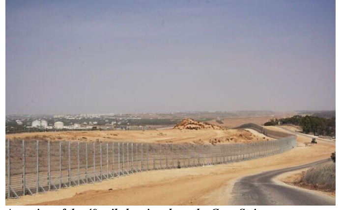
A portion of the 40-mile barrier along the Gaza Strip, upon completion on December 7, 2021.

NETIV HA'ASARA — Standing in the shadow of a 30-foot-high concrete wall, top defense officials announced Tuesday that Israel had completed construction of a massive barrier running the length of the Gaza Strip both above and, critically, below ground.