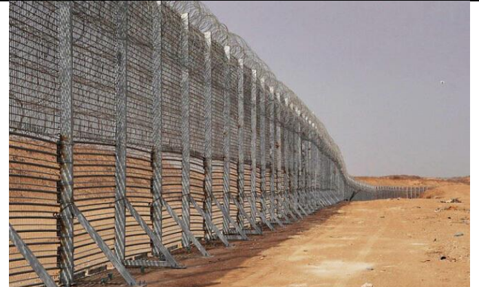
A portion of the 40-mile barrier along the Gaza Strip, upon completion on December 7, 2021.

By <u>Judah Ari Gross</u> Today, 4:45 pm