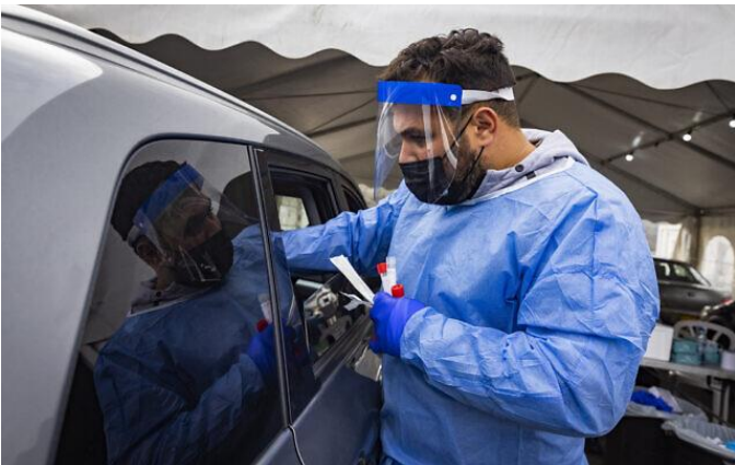
A health worker takes swab samples from Israelis at a drive-thru COVID-19 testing site in Jerusalem on January 2, 2022.

“Be patient,” Bennett said. “We know there are lines at the testing centers... We’re preparing to change the criteria for tests in order to reduce the crowding.”