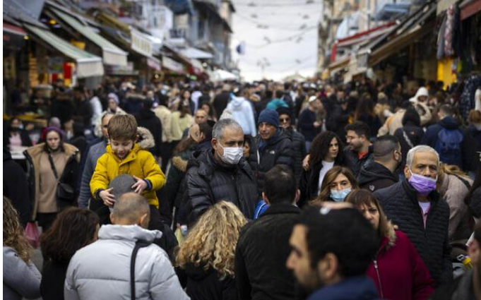
People shop at the Mahane Yehuda Market in Jerusalem on December 24, 2021.

A leading health expert advising the government predicted Sunday morning that one out of every three or four Israelis will be infected with the Omicron variant of the coronavirus over the next three weeks, cautioning that most won’t know they’ve been infected because the country is quickly running out of test kits.