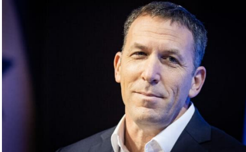
Religious Services Minister Matan Kahana

The private agencies will be authorized to issue certifications that note they are "under the supervision of the Rabbinate." Each agency is expected to be headed by a rabbi who is certified by the city's local rabbinate. The agencies — which will also need to demonstrate financial viability — will make public the religious standards they are maintaining in their certification.