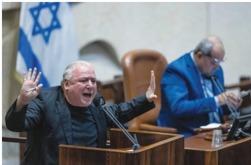
MK DAVID AMSALEM addresses the Knesset plenum during a debate last month.

But Likud MK David Amsalem has called the bill “the most dangerous step since the state was founded.”