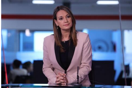
Education Minister Yifat Shasha-Biton

The education minister also blamed parents' hesitancy for low vaccination turnout, along with inadequate efforts on the Health Ministry's part to educate children on the benefits of the vaccine.