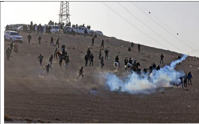
Bedouin protesters and Israeli forces clash during a protest in the southern Israeli village of Sawe al-Atrash in the Negev Desert against a forestation project by the Jewish National Fund (JNF), on January 13, 2022.