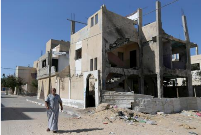
A Palestinian man walks outside a house that was damaged by Israeli strikes during Israel-Hamas fighting last May, in Khan Younis in southern Gaza Strip

He is one of the lucky few. Only 50 of 1,650 homes wrecked in an 11-day war between Gaza militants and Israel are being restored, leading to frustration among Palestinians at the slow pace of reconstruction eight months after the conflict ended.