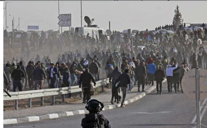
Bedouin protesters and Israeli forces clash during a protest in the southern Israeli village of Sawe al-Atrash in the Negev Desert against a forestation project by the Jewish National Fund (JNF), on January 13, 2022.

By Emanuel Fabian and TOI staff Today, 6:01 pm