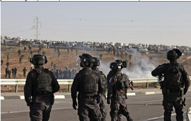
Bedouin protesters and Israeli forces clash during a protest in the southern Israeli village of Sawe al-Atrash in the Negev Desert against a forestation project by the Jewish National Fund (JNF), on January 13, 2022.

Hundreds of Bedouin protesters clashed with police on Thursday afternoon for the third day in a row over a controversial forestation project in the Negev Desert, despite reports indicating the government was seeking a compromise.