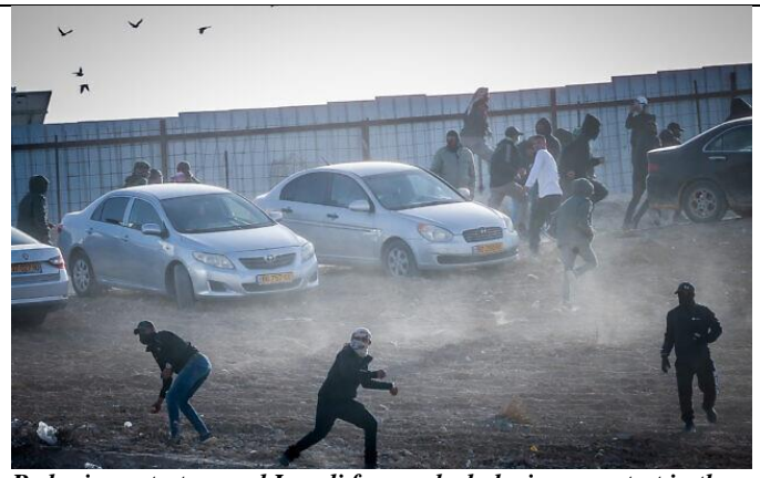
Bedouin protesters and Israeli forces clash during a protest in the southern Israeli village of Sawe al-Atrash in the Negev Desert against an forestation project by the Jewish National Fund (JNF), on January 13, 2022.