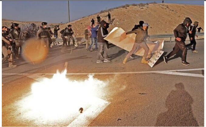
Bedouin protesters and Israeli forces clash during a protest in the southern Israeli village of Sawe al-Atrash in the Negev Desert against a forestation project by the Jewish National Fund (JNF), on January 13, 2022.