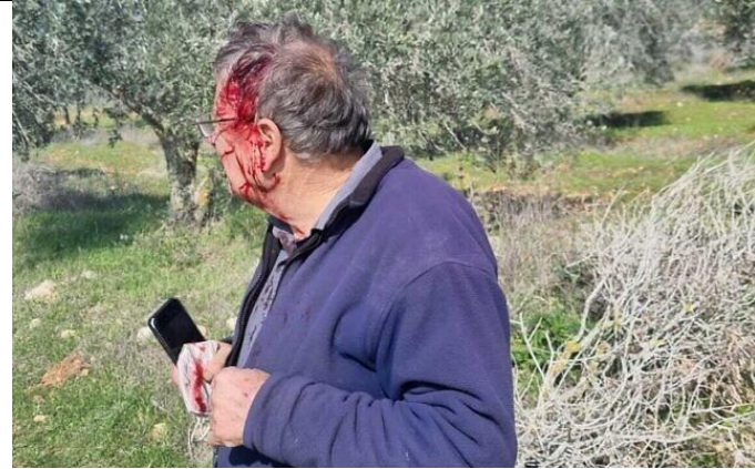
An Israeli activist, bloodied from a beating allegedly by Jewish extremists in the West Bank near the outpost of Givat Ronen on Friday, on January 21, 2022.