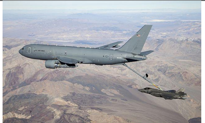
A US Air Force Boeing KC-46 Pegasus aerial refueling plane connects to an F-35 fighter jet over California, January 22, 2019.

Because of the distance, carrying out an airstrike inside Iran and having enough fuel for the return trip would require Israeli planes to refuel in the sky or find a friendly airbase to land at.