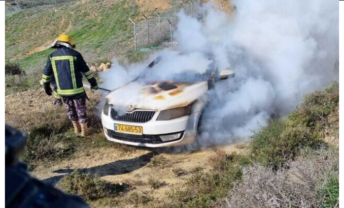
A firefighter douses the flames in an Israeli car after it was allegedly set on fire by Jewish extremists in the West Bank near the outpost of Givat Ronen on Friday, on January 21, 2022.