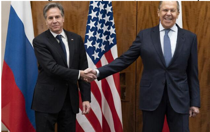
US Secretary of State Antony Blinken (left) shakes hands with Russian Foreign Minister Sergey Lavrov before their meeting, on Friday, January 21, 2022, in Geneva, Switzerland.

"We didn't expect any major breakthroughs to happen today, but I believe we are now on a clearer path to understanding each other's positions," Blinken told reporters after the meeting.