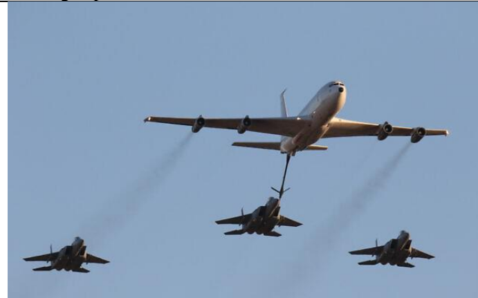
Boeing 707 and F-15 demonstrate mid-air refueling, December 1, 2014.

According to reports at the time, the clips marked the first time the IDF had ever published videos showing its mid-air refueling capabilities.