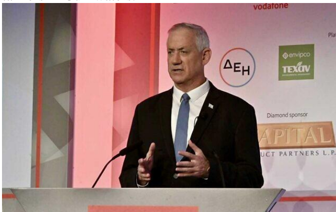
Defense Minister Benny Gantz speaks at the Economist Government Roundtable conference, Greece, July 5, 2022.

Iranian hijackers also stormed and briefly captured a Panama-flagged asphalt tanker off the United Arab Emirates last year, as well as briefly seizing and holding a Vietnamese tanker in November. In May, Iran seized two Greek-flagged oil tankers in Gulf waters.