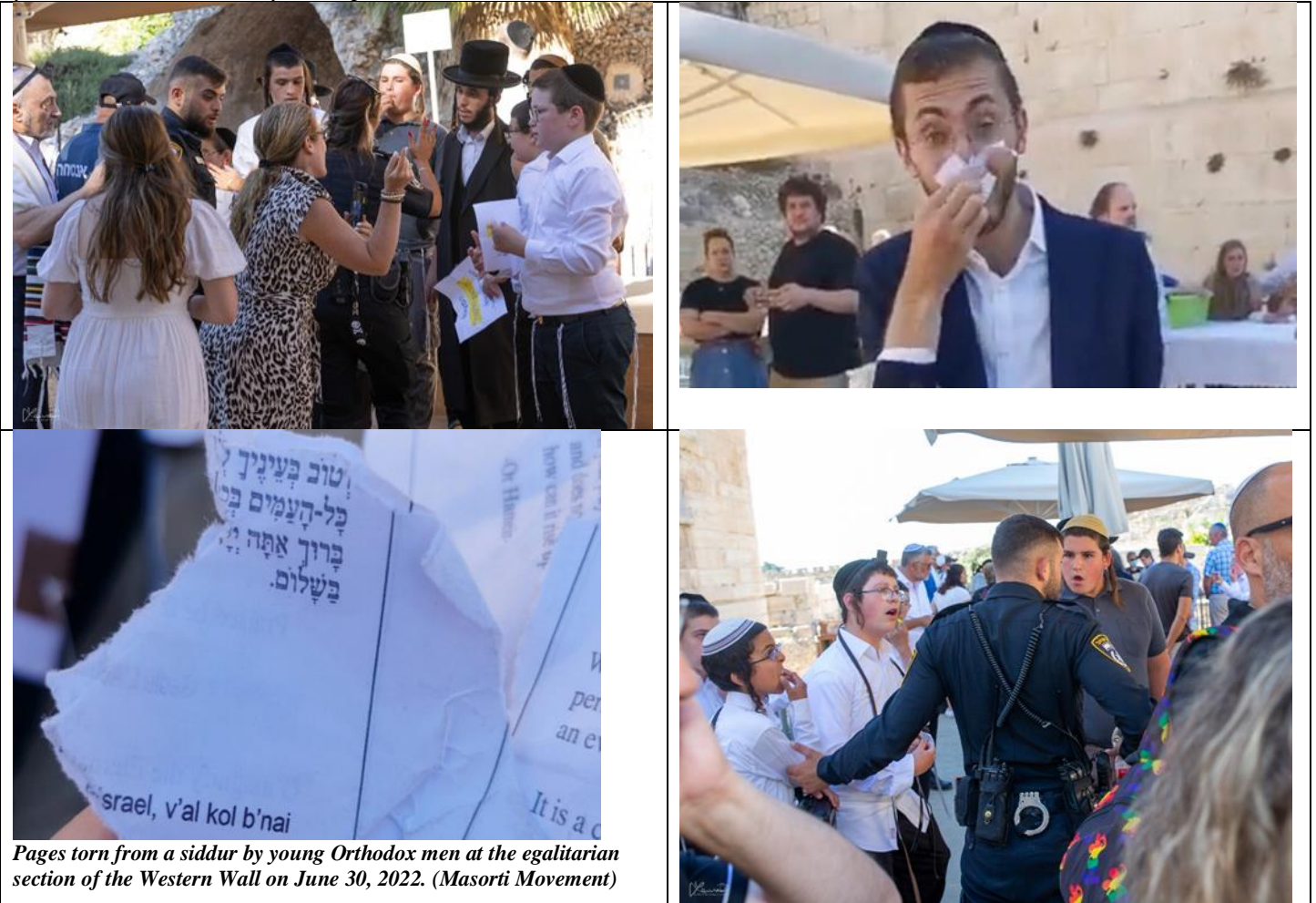
Pages torn from a siddur by young Orthodox men at the egalitarian section of the Western Wall on June 30, 2022.

ToI investigates 'This is what the Nazis would do. And they called us Nazis!'