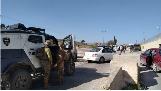
Soldiers near Homesh Homesh yeshiva

Several terrorists opened fire on IDF forces from a passing vehicle near Homesh Tuesday.