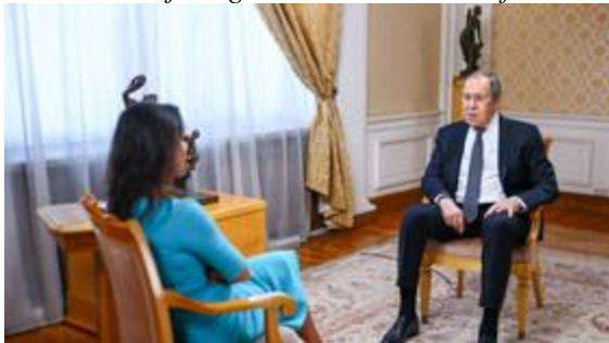
Russian Foreign Minister Sergey Lavrov speaks to RT Editor-in-Chief Margarita Simonyan during an interview, July 2022.

The Russian foreign minister sat down for an hour-long interview with RT Editor-in-Chief Margarita Simonyan