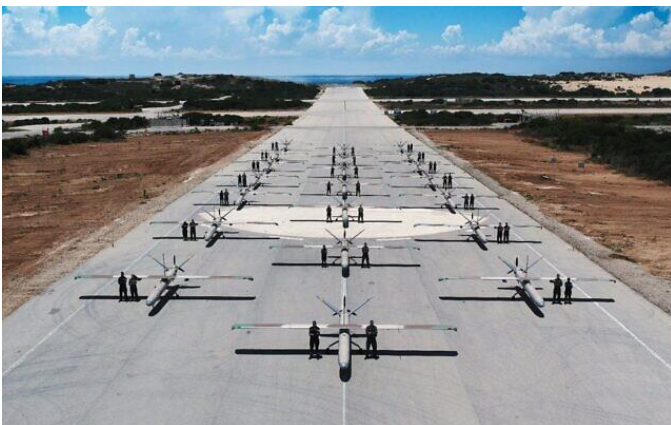
File: The IAF’s 161st Squadron’s fleet of Hermes 450 drones at the Palmachim airbase.

Drones have also been used in a technique known as “knocking on the roof,” in which an inert missile is fired at the roof of a building to warn residents to leave before the structure is destroyed by armed munitions.