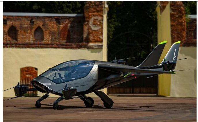
Israeli startup AIR developed an eVTOL aircraft called AIR ONE for consumer use.

The company “combines sustainable aerospace innovation with automotive know-how” and is tapping into a nascent eVTOL market estimated to reach $12 billion by 2030.