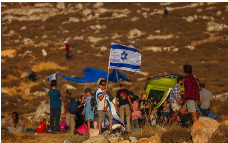
Settlers of the Nachala Settlement Movement set up tents near Kiryat Arba, with the intention to establish illegal outposts in Judea and Samaria, at the Gush Etzion Junction. July 20, 2022.

Thousands of right-wing Israeli activists flocked to the West Bank on Wednesday in an effort to establish six new illegal outposts in the territory.