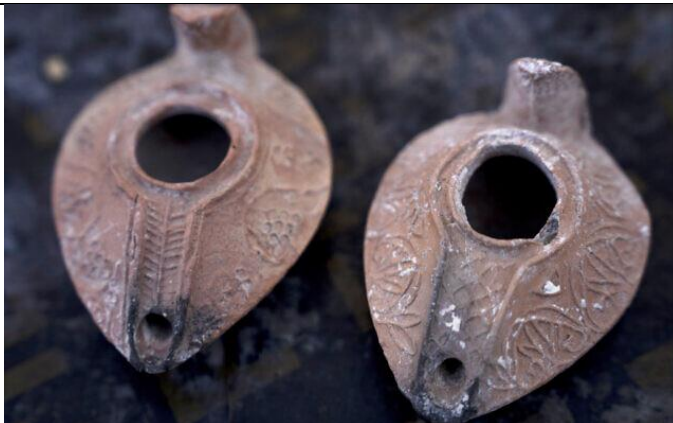
Clay oil lamps from the Islamic period is displayed at site of a Jewish ritual bath or mikveh, near the Western Wall in the Old City of Jerusalem, July 17, 2022