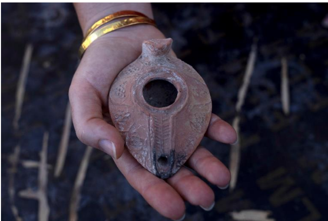
A clay oil lamp from the Islamic period is displayed at site of a Jewish ritual bath or mikveh, near the Western Wall in the Old City of Jerusalem, July 17, 2022.

Historical waypoints included Ottoman pipes built into a 2,000-year-old aqueduct that supplied Jerusalem with water from springs near Bethlehem; early Islamic oil lamps; bricks stamped with the name of the 10th Legion, the Roman army that besieged, destroyed and was afterwards encamped in Jerusalem two millennia ago; and the remains of the Judean villa from the final days before the ancient Jewish Temple's destruction in the year 70 CE.