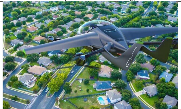
The AIR ONE eVTOL aircraft by Israeli startup AIR.

The aircraft completed multiple hovers throughout over two weeks, lifting off, hovering in place, and returning to the ground, "performing optimally in a stable flight envelope," the company said. (A flight envelope is the operating parameters and capabilities of an aircraft based on its design. It refers to factors like airspeed, altitude, and load factor.)