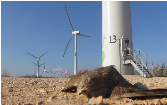
A dead common kestrel at the foot of a wind turbine at Sirin in 2017.

Seven new wind turbines that will tower over the Golan at the height of Tel Aviv skyscrapers were given the green light Monday by the National Infrastructure Council. If Environmental Protection Minister Tamar Zandberg has her way, they will be the last ones for at least five years.