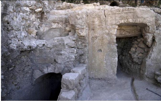
The site of a Jewish ritual bath or mikveh, left, discovered near the Western Wall in the Old City of Jerusalem, July 17, 2022