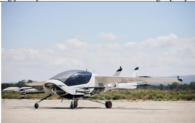
Israeli startup AIR's AIR ONE prototype aircraft for the consumer market.

"This test is the first time that [AIR's] full-scale, full-weight aircraft was tested in flight," marking "the beginning of a long journey that will continue to a manned flight [test] and later evolve into mass production unit testing," he said.