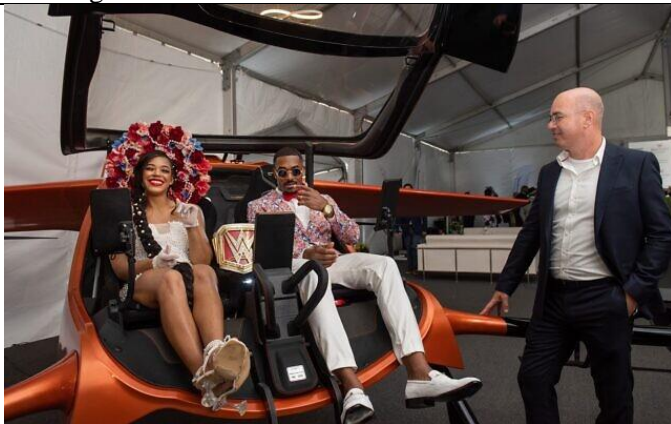
The AIR ONE aircraft by Israeli startup AIR is shown at the Kentucky Derby, May 2022.

With AIR, the founders set out to “make a true difference by making the freedom of flight truly accessible to people,” according to Plaut.