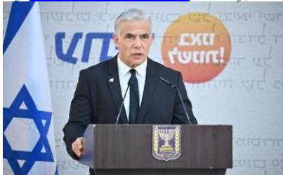
Prime Minister Yair Lapid gives a campaign speech on July 20, 2022. (Elad Gutman)

Prime Minister and Yesh Atid leader Yair Lapid transitioned into campaign mode on Wednesday evening, calling for "a strong Yesh Atid" as the "one thing" that can deliver a stable government "without extremists."