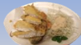
* Mahi Tempura *