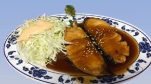
* Butter Fish Teriyaki *