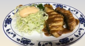
* Butter Fish Miso *