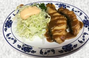
Butter Fish Miso*