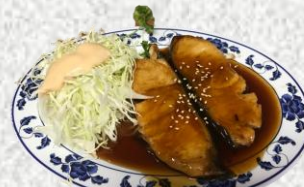
Butter Fish Teri*