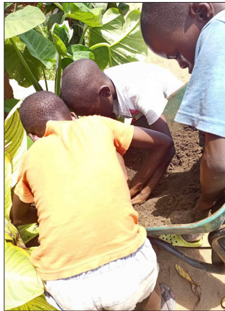
The boys are helping with yard work around their new home.