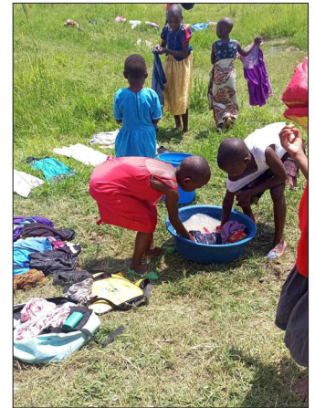
The girls are doing laundry as part of their family chores.