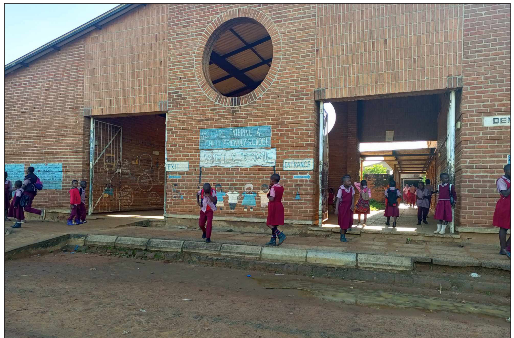
The children are waiting for school to begin.