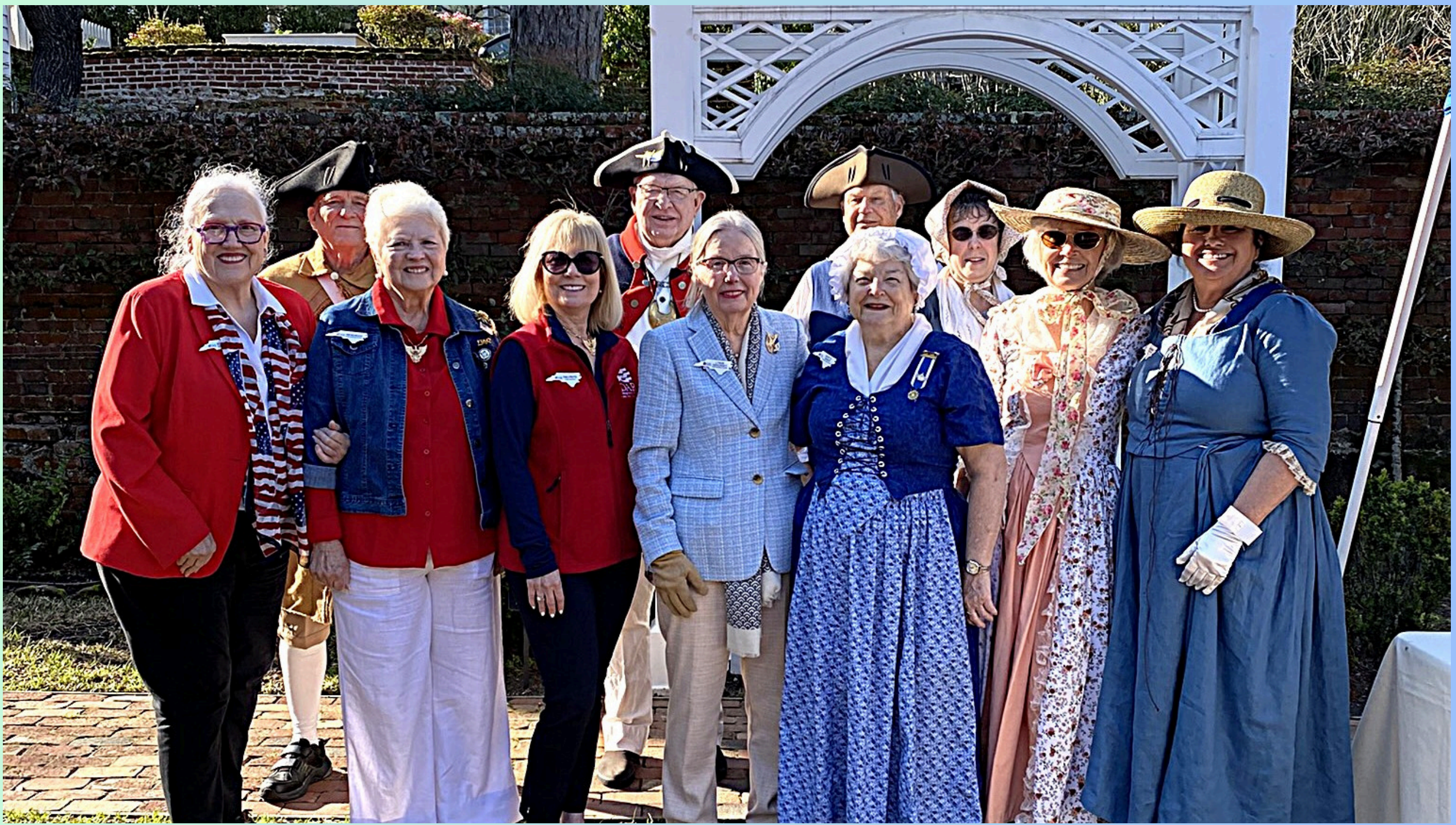
Stamp Defiance members attended the America 250! Fair at the Burgwin-Wright House