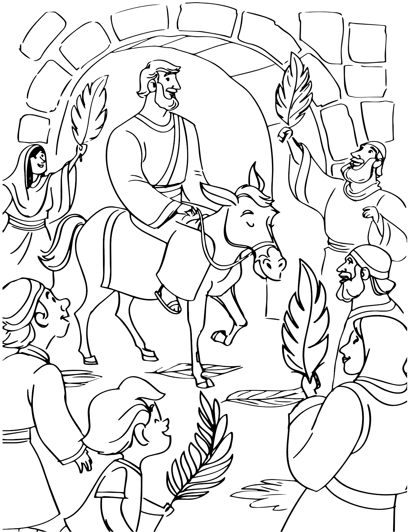
The triumphal entry