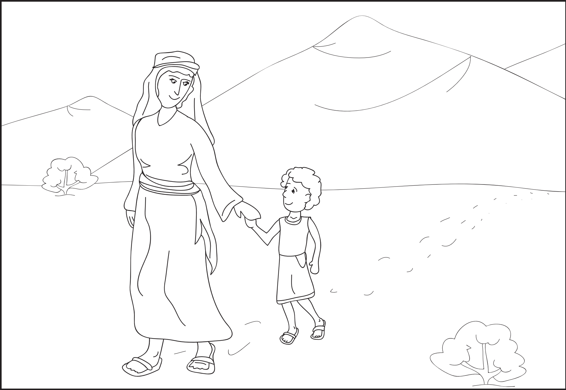
Hagar and Ishmael