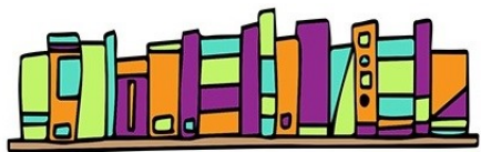
THE BOOK CLUB

The next meals will be Saturday, July 27th and August 31st from 12 to 1 PM