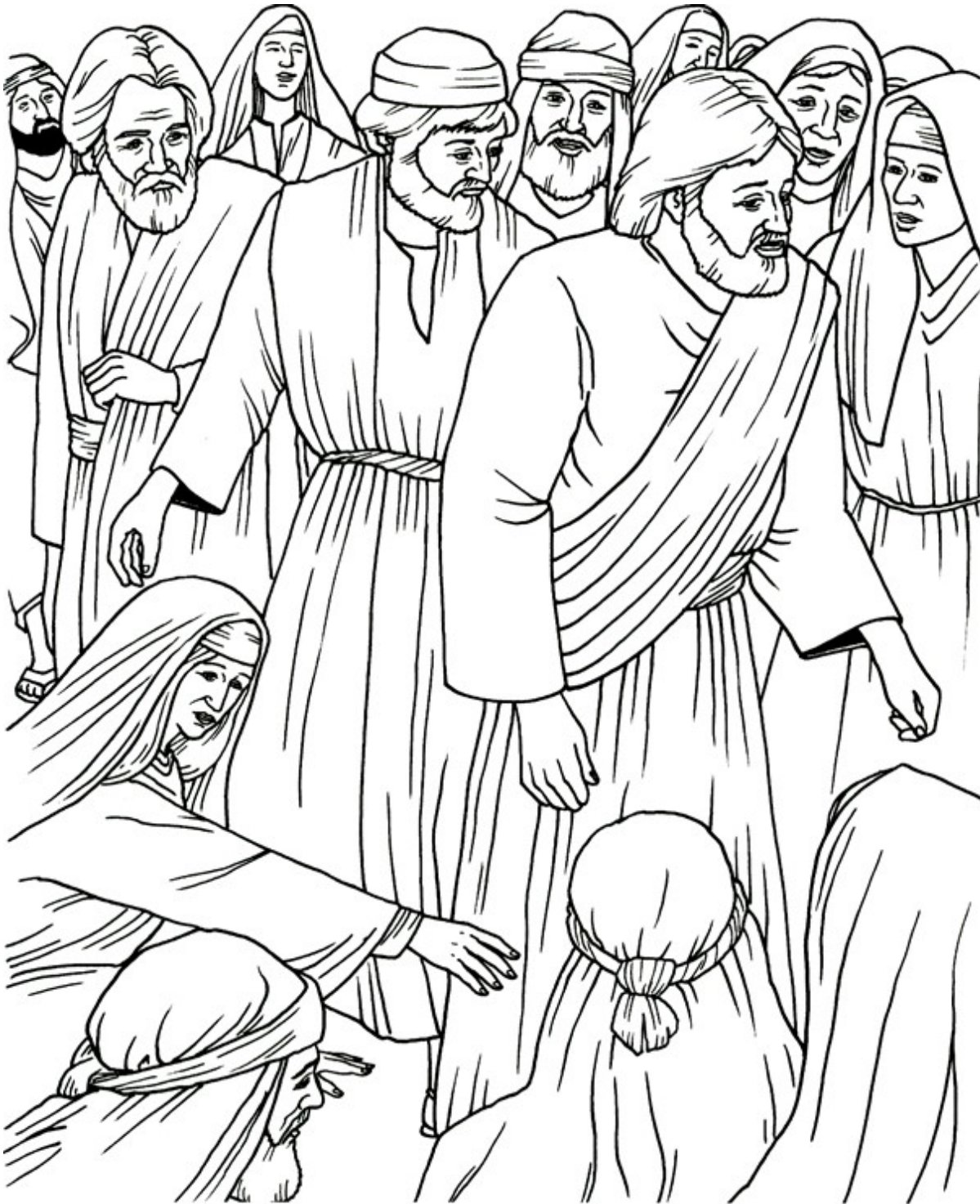
Touching the Garment