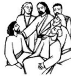
Calling the Twelve to him, he sent them out two by two. Mark 6:7 (NIV)