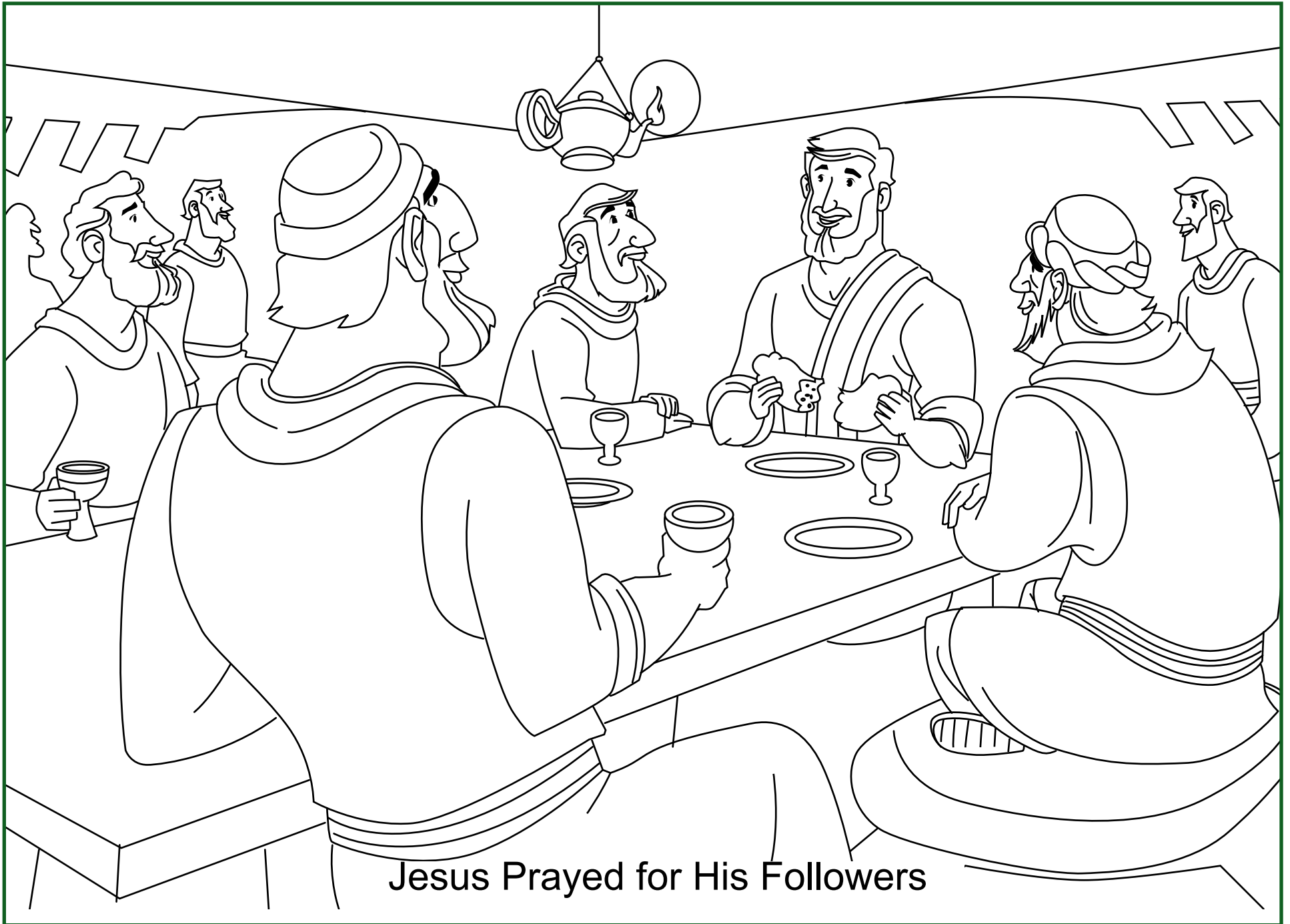
Jesus Prayed for His Followers