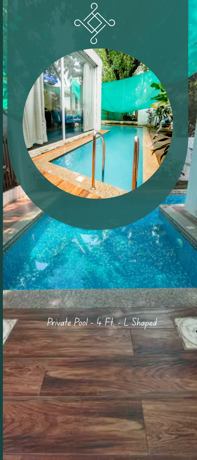
Private Pool - 4 Ft. - L Shaped