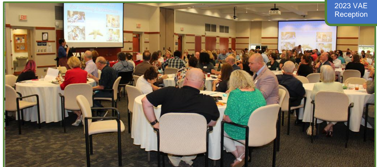
2023 VAE Reception