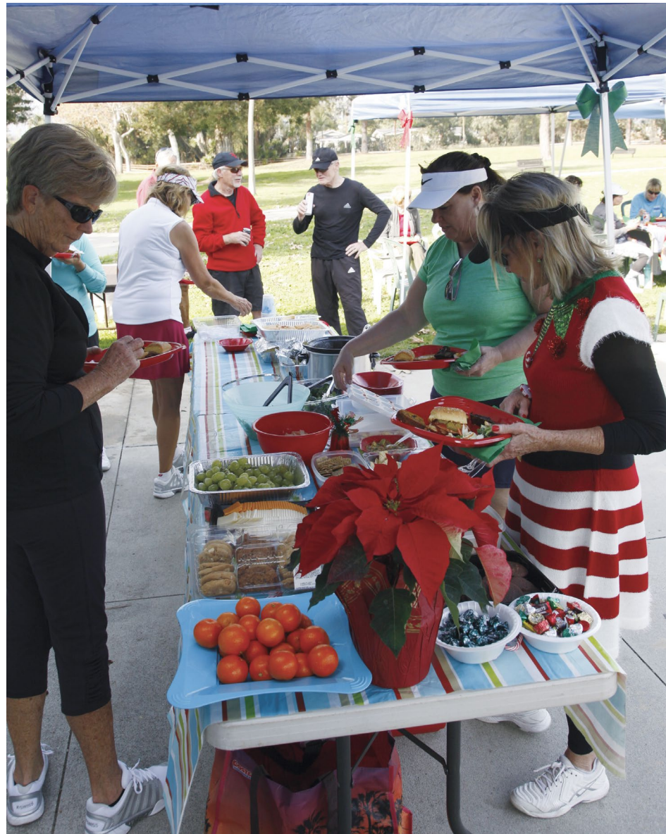
A great BBQ lunch was served to celebrate the holidays and end the year