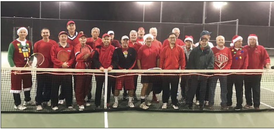
TNT (Tuesday Night Tennis) men's doubles held its annual holiday party. The group has existed for over 30 years.