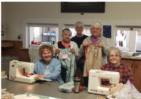
Pillowcase Dress Sewing Crew.