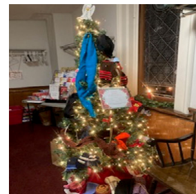
Photo of the giving tree