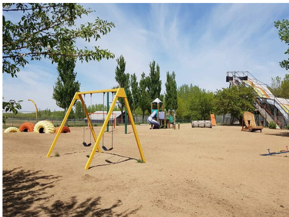
Photos of the Grounds and a map showing the short distance to one of a few hotels nearby.