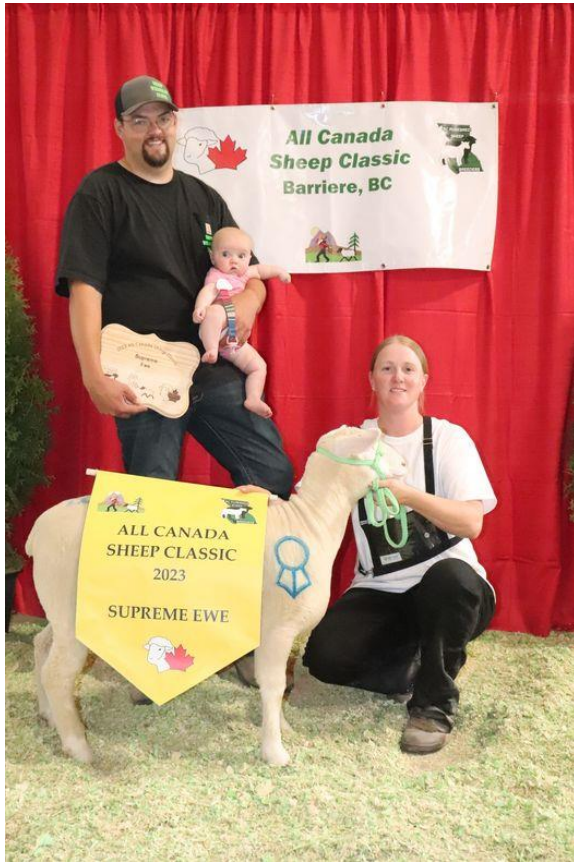
Supreme Ewe The Supreme Champion Ewe was an Ile de France (WRANGLER 240K) consigned by Sheep Wrangler Farms from Barrhead, AB