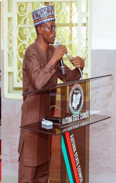
OTVI organized World Trauma Day Commemoration, Theme: Embracing Resilience, overcoming trauma's impact; the role of government and religious actors. Event held in Katsina State, Nigeria.