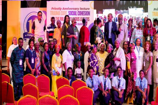
OTVI organized conference on trauma care, social cohesion and the role of religious leaders