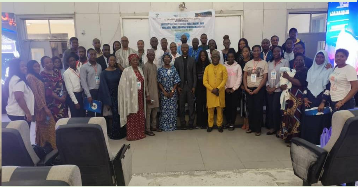
OTVI organized World Trauma Day Commemoration, Theme: Embracing Resilience, overcoming trauma's impact; the role of government and religious actors. Event held in Base University, Abuja FCT, Nigeria.