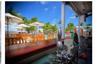
Eco-Bar, Key West