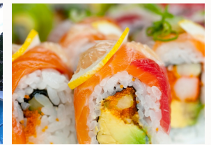
Signature 8-Course Tasting at this Japanese Hot Spot