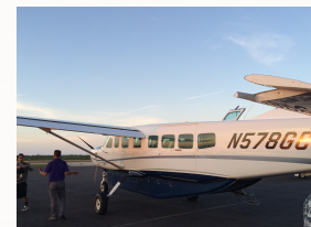
Waiting for you...and your Closest Friends

It’s all yours. Charter the aircraft for the evening - explore the Island culture, taste the local specialties and wander the picturesque streets. Trip includes: Round trip flight incl. taxes + fees (Dep. 4:00 pm, Ret. Miami by 12:00 am) for up to 9 passengers, premium in-flight drinks and gourmet snacks, gift bag including maps, restaurants and places to see and photos to last a lifetime.