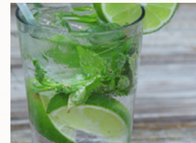
Freshly Made Authentic Cuban Mojito

Extend the Classic Evening above and stay for the weekend. Depart on Friday, enjoy the Classic Evening of oceanside cocktails and dinner and return on Sunday. Trip includes the Classic Evening in Key West (above package) plus return flight on Sunday. Hotel, food and activities on additional days not included. Min. 8 guests.