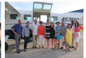
Time to Depart...for an Evening of Adventure