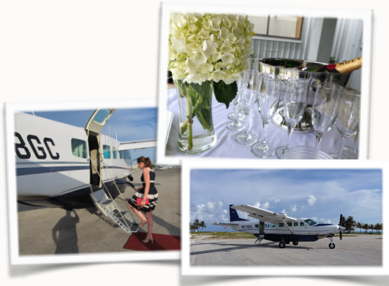
Landing in Key West...Minutes to Town. Let the Adventure Begin...

Fly Private Air to Key West for the evening to experience a once-in-a-life time adventure. Depart Miami in the afternoon and arrive in Key West just 43 minutes later. Be immersed in island culture, explore signature dishes and eco-friendly cocktails that define this lively and artsy island on the Southernmost point of the United States.