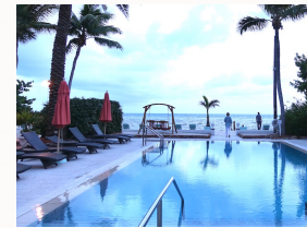
Oceanside Cocktails at the Historic Southernmost

Fly Private Air to Key West with up to 8 other dinner guests for an evening of oceanside cocktails at the historic Southernmost House, a bit of Hemingway history, and an 8-course tasting dinner at one of Key West’s finest Japanese restaurants. Includes: Round trip flight (same day), in-flight premium beverages, Key West transfers, cocktails, dinner, gift bags, taxes+fees. Min. 8 guests.