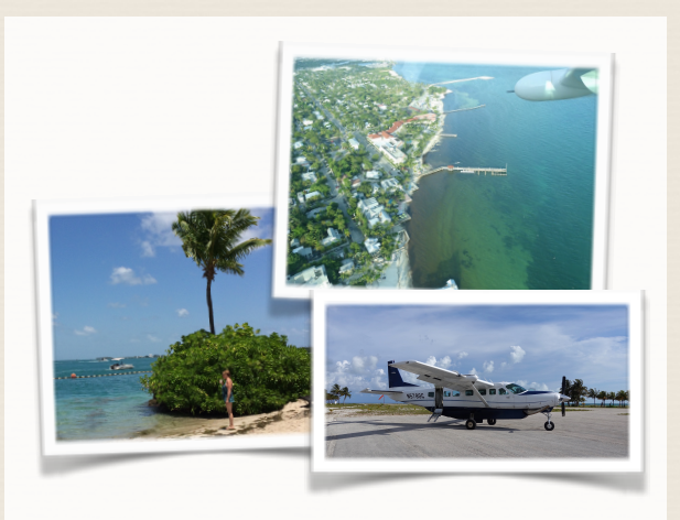
Landing in Key West...Minutes to Town. Let the Adventure Begin...

At the Southernmost tip of the United States, just 90 miles from Cuba, is the quirky, artsy Island of Key West. Set amongst crystal blue waters, the picturesque town is full of historic inns, local boutiques, rustic oceanside seafood restaurants and bars on every corner.