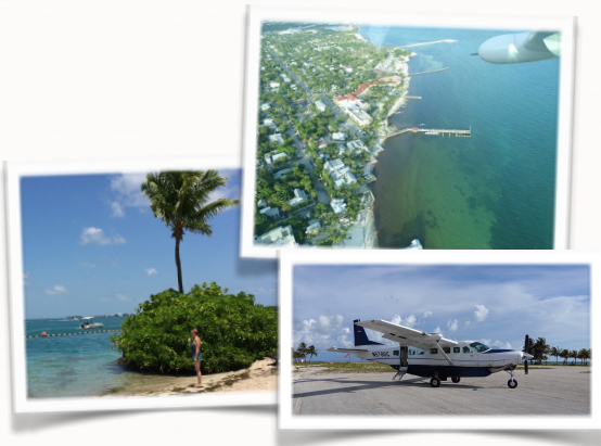
Landing in Key West...Minutes to Town. Let the Adventure Begin...

Fly Private Air to Key West for the evening to experience a once-in-a-life time adventure. Depart Miami in the afternoon and arrive in Key West just 43 minutes later. Be immersed in island culture, explore signature dishes and eco-friendly cocktails that define this lively and artsy island on the Southernmost point of the United States.