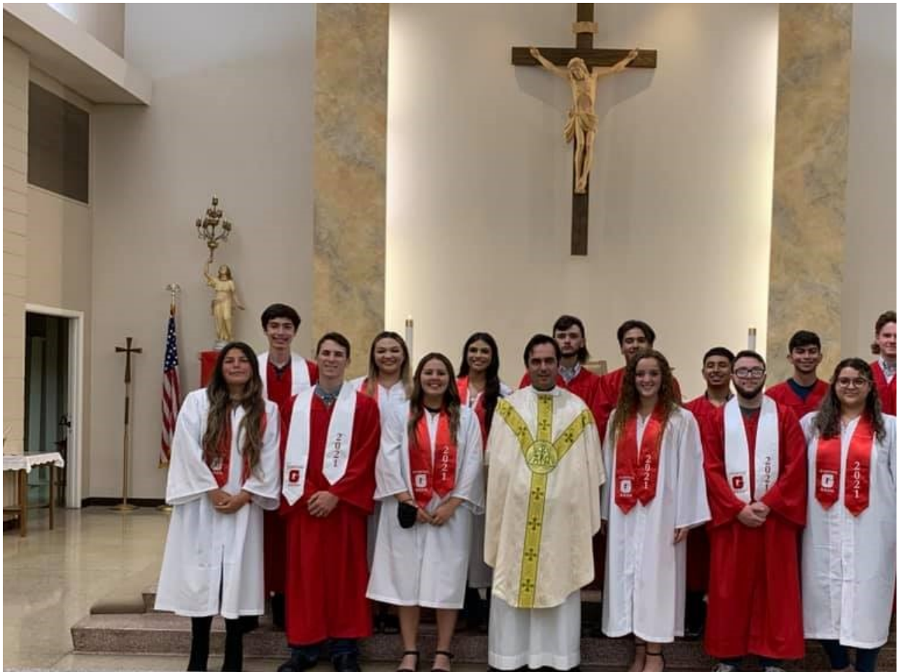
Well Done 2021 High School Graduates