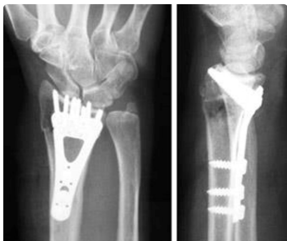
A plate and screws hold the broken fragments in position while they heal.