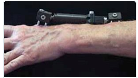
An external fixator

Open fractures. Surgery is required as soon as possible (within 8 hours after injury) in all open fractures. The exposed soft tissue and bone must be thoroughly cleaned (debrided) and antibiotics may be given to prevent infection. Either external or internal fixation methods will be used to hold the bones in place. If the soft tissues around the fracture are badly damaged, your doctor may apply a temporary external fixator. Internal fixation with plates or screws may be utilized at a second procedure several days later.