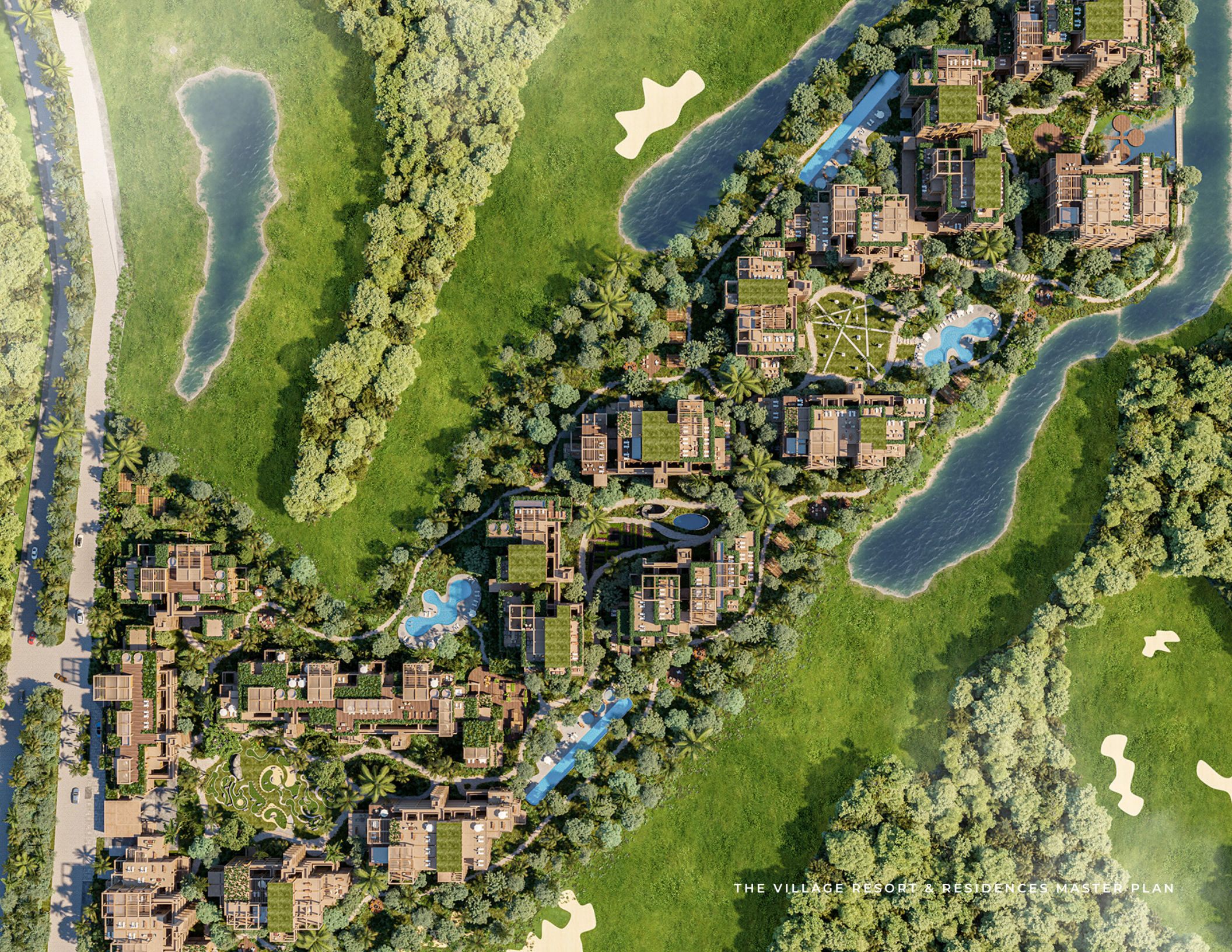
THE VILLAGE RESORT & RESIDENCES MASTER PLAN