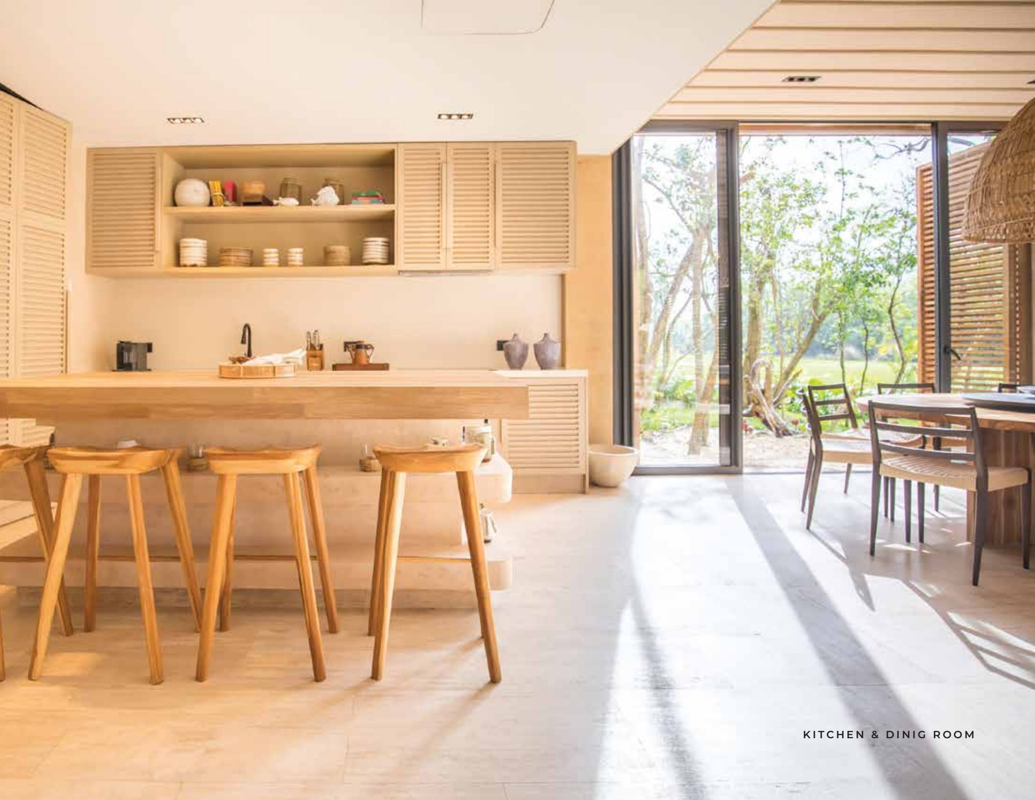
KITCHEN & DINING ROOM