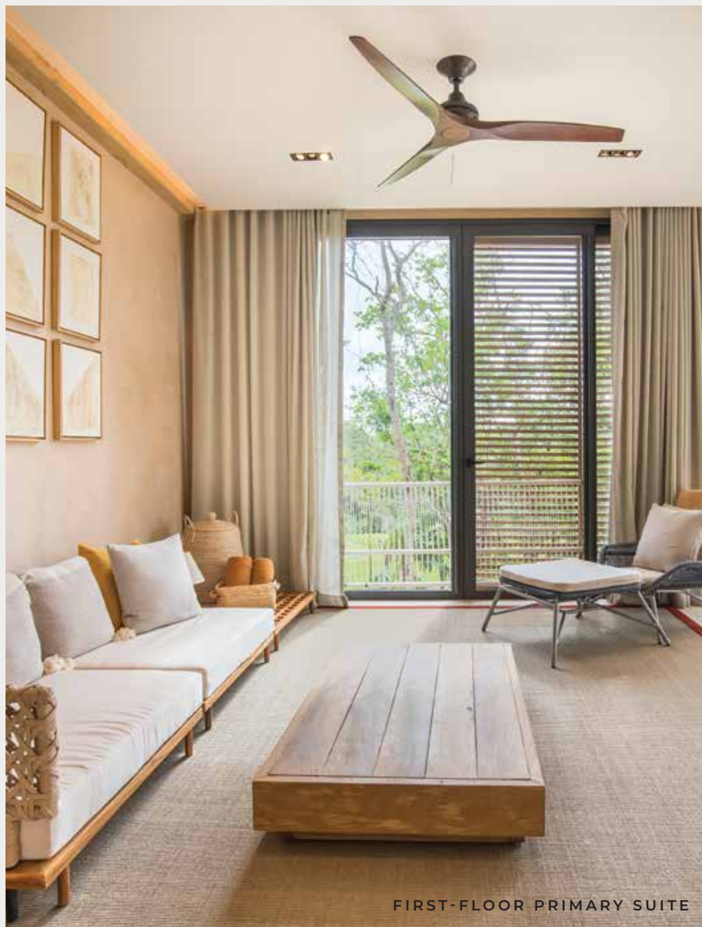
FIRST-FLOOR PRIMARY SUITE