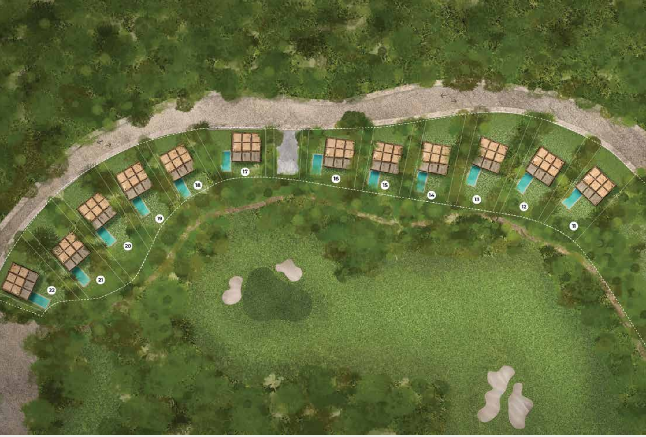
PALM VILLAS ESTATE HOMES PHASE 2