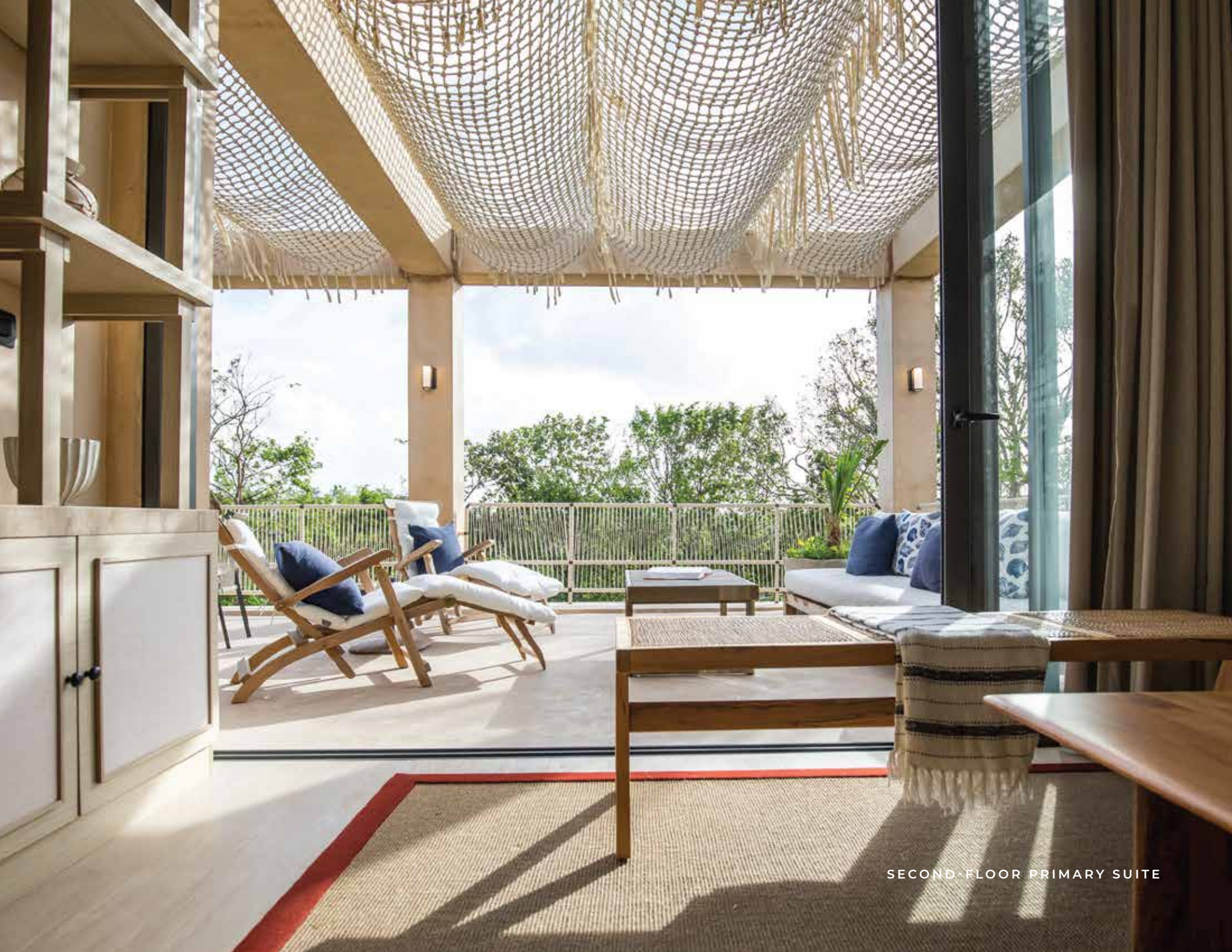
SECOND-FLOOR PRIMARY SUITE