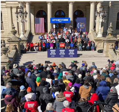
Former Congresswoman Gabby Giffords & elected Democrats rally at the State Capitol for gun reform.

Although the package is mainly supported by Democratic lawmakers, two former Michigan Republican congressmen, Fred Upton and Dave Trott, declared their support for the Democratic gun safety package. “As strong supporters of the Second Amendment and proud Republicans, we feel it is our duty to come out in support of this legislation,” the two former congressmen said in a joint statement. “Students, educators, and parents in Michigan have suffered through multiple mass shootings in the past fifteen months, and Michiganders deserve action.”