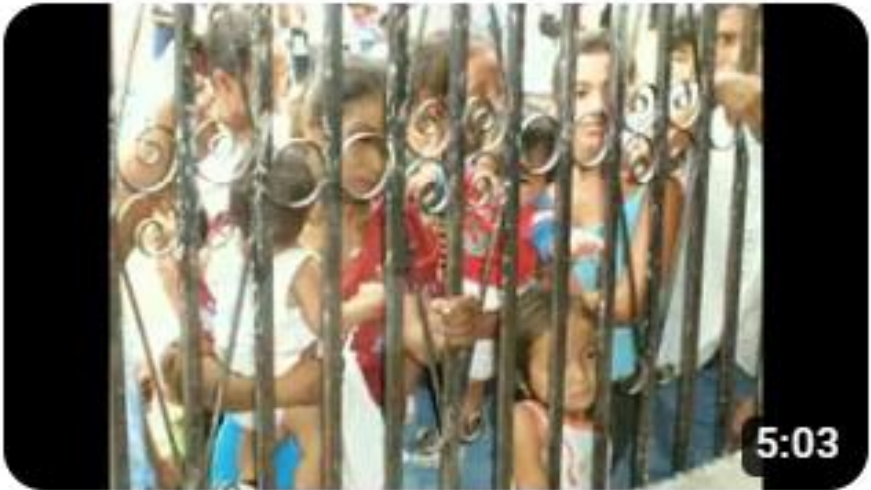
2008 Healing Water Mission