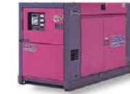
Super Soundproof Type