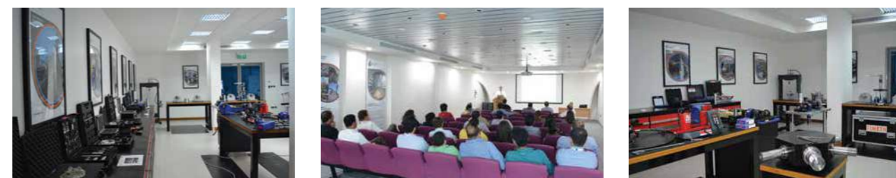
Rolman World Industrial Services - Our Facilities

At our Dubai Headquarters, we have designed our operation with service at the forefront. A 60-seat auditorium offers the ability to bring together our customers, our engineers and our suppliers to discuss solutions, the latest technologies and industry best practice. Knowledge is the start of better performance.