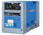
Diesel Welding Sets