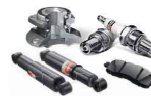
Automotive Spare Parts