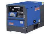
Diesel Generating Sets (3 Phase)

Denyo is one of Japan's leading manufacturers of engine-driven generators, welders and air compressors. Since its establishment in 1948, the Company has also continued to develop periphery product lines that include high-powered mobile lighting, water-related devices, self-propelled work lifts and primary and emergency-use generating sets. Denyo continues to expand its marketing network and now sells its products in more than 100 countries worldwide.