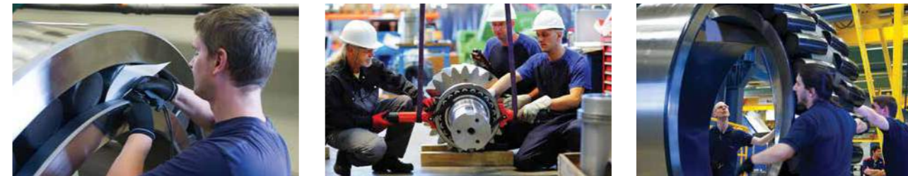
Rolman World Industrial Services – A Member of Your Maintenance Team

Nowadays, simply selling products is not enough. Manufacturers in every industry know that it needs to continuously improve its productivity and reduce costs in order to stay ahead of fierce competition. Unplanned plant stoppages are expensive. Inefficient processes cost time and money.