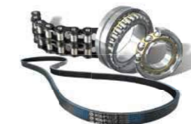
Industrial Power Transmission Replacement Parts