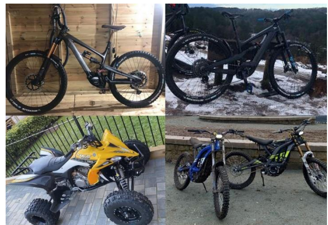
The five motorised bikes that were stolen during the Winsford robbery