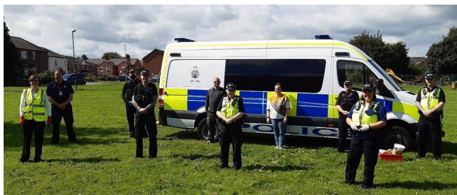
Officers and volunteers at one of the four knife sweeps