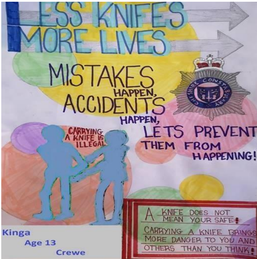
The winning knife crime prevention poster competition entry