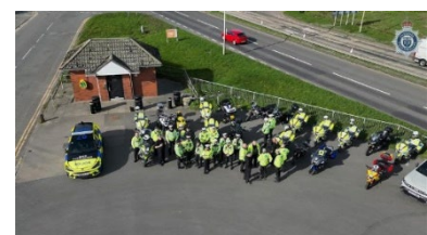
Officers from three forces came together to launch Operation Caesar over the Easter bank holiday